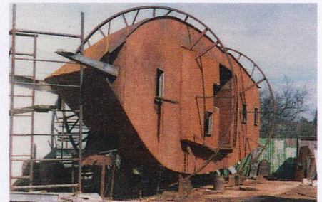
Christabelle in progress