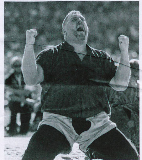
Christian Stucki celebrates his victory in the final round of the Federal Schwingen Festival in Zug in August.

"Mein Onkel hat fünfhundert Leute unter sich." "Was für eine wichtige Person ist er denn?" „Friedhofgärtner."