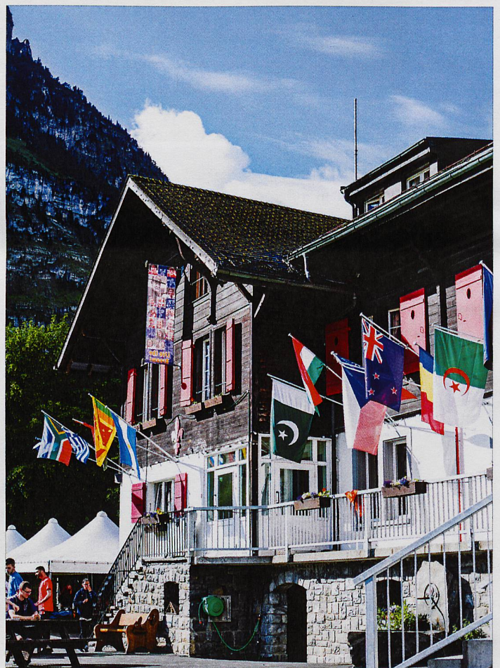
KISC | Flags outside the building in recent years.