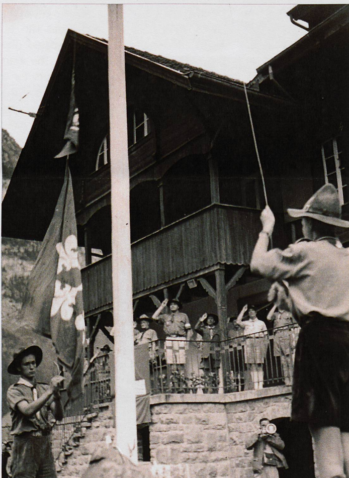
KISC | Raising the flag in 1953.