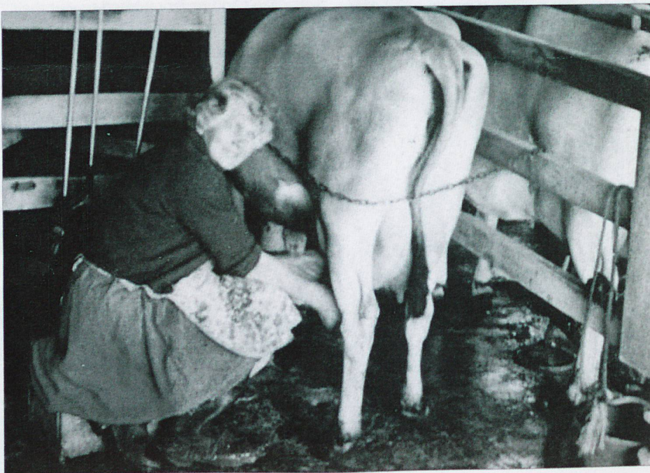
Kurigers | Rosa milking one of their Jersey cows in 1977.

During the Depression there was little money, but the children were always loved, clothed, and fed well. Crops were planted in a portion of the field, with mixtures of vegetables and of course potatoes! They felt incredibly lucky to be on a farm as they had milk, home kill meats (beef, sheep, and pigs), hens supplied eggs and chicken for soups and they had few fruit trees too. Swaggers called in many times, some just for a feed