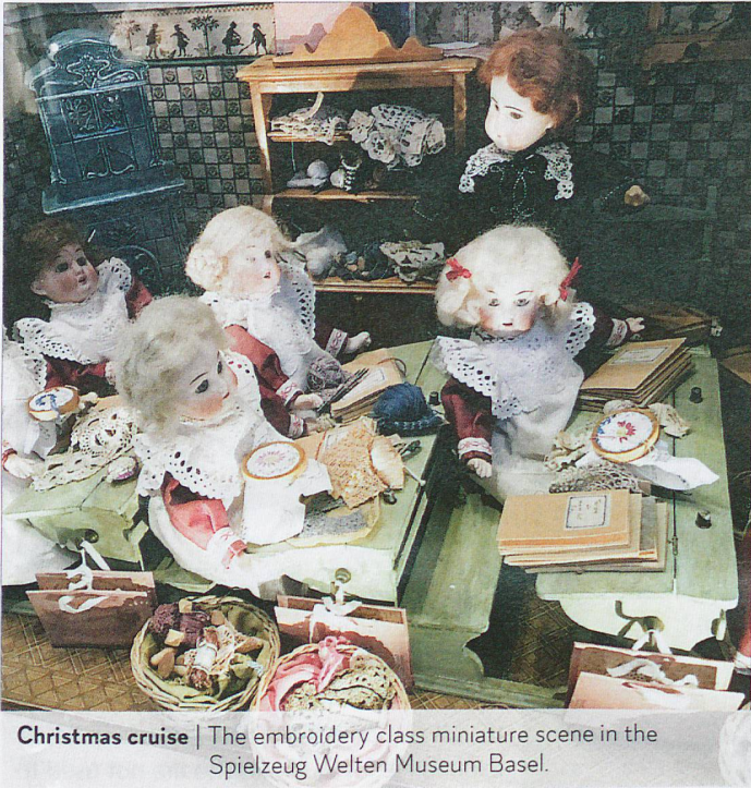
Christmas cruise | The embroidery class miniature scene in the Spielzeug Welten Museum Basel.