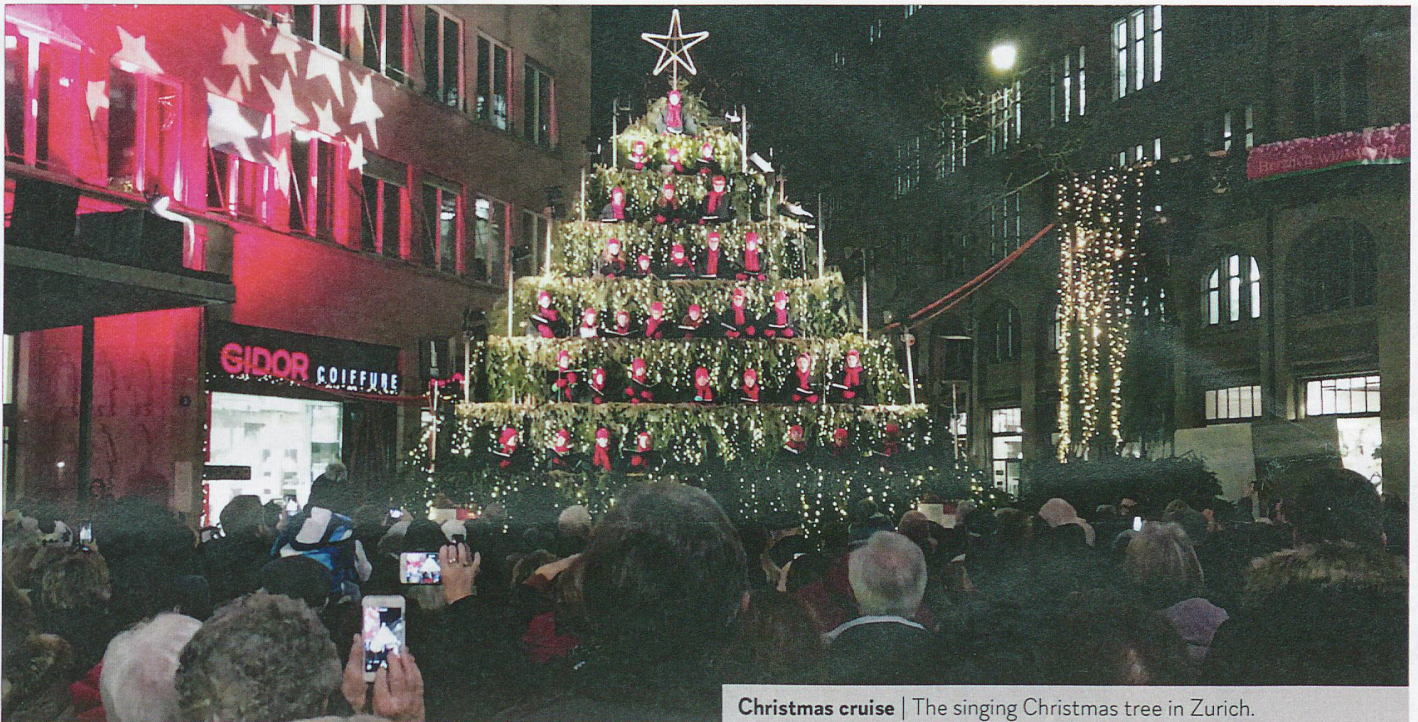
Christmas cruise | The singing Christmas tree in Zurich.

filled to bursting with Christmas cookies, decorations and delights. There are several markets here, many of them themed.