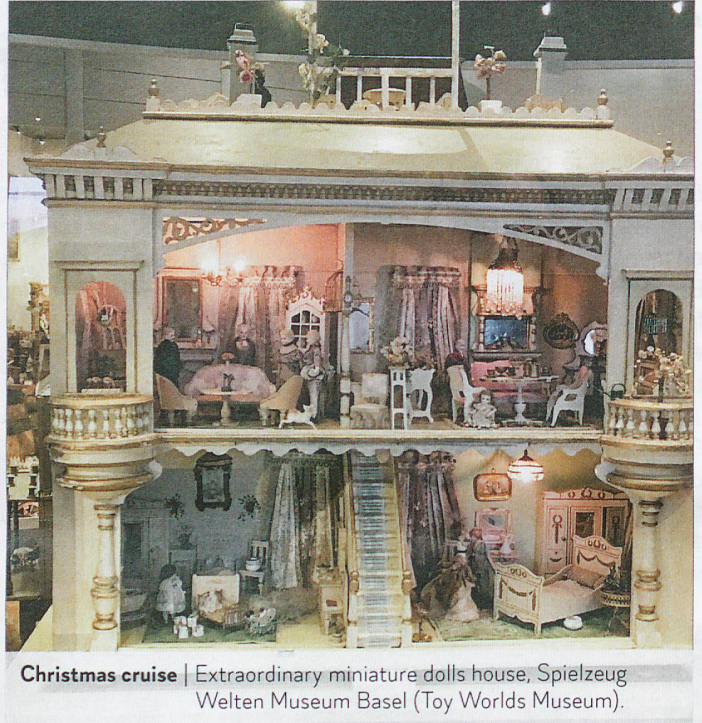
Christmas cruise | Extraordinary miniature dolls house, Spielzeug Welten Museum Basel (Toy Worlds Museum).

regional specialities such as Rüdeshimer coffee – with brandy and whipped cream, specialty German sausages served with sauerkraut and noodles, lebkuchen, pfeffernuesse.