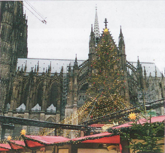
Christmas cruise | The Köln market with its giant Christmas tree in the shadow of the cathedral.

won of course – nothing to do with rigged voting!), sampling fantastic local wines and food, decorating a giant Christmas tree and a present swap. We were also shown how to cook some of the many varieties of special Christmas cookies which we enjoyed sampling on board and in the markets. The meals on board were magnificent with an ever-changing variety presented, so very easy to put on weight. As one of our tour guides suggested: "You embark as passengers and we off-load you as cargo!"