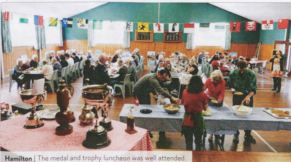
Hamilton | The medal and trophy luncheon was well attended.