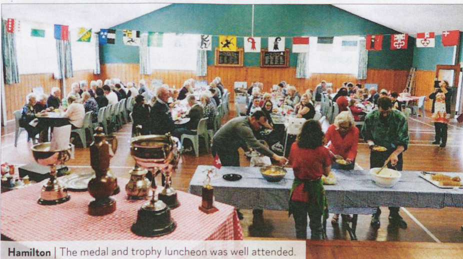
Hamilton | The medal and trophy luncheon was well attended.