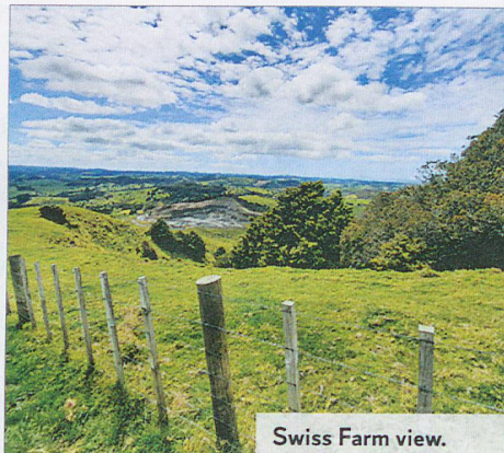
Swiss Farm view.