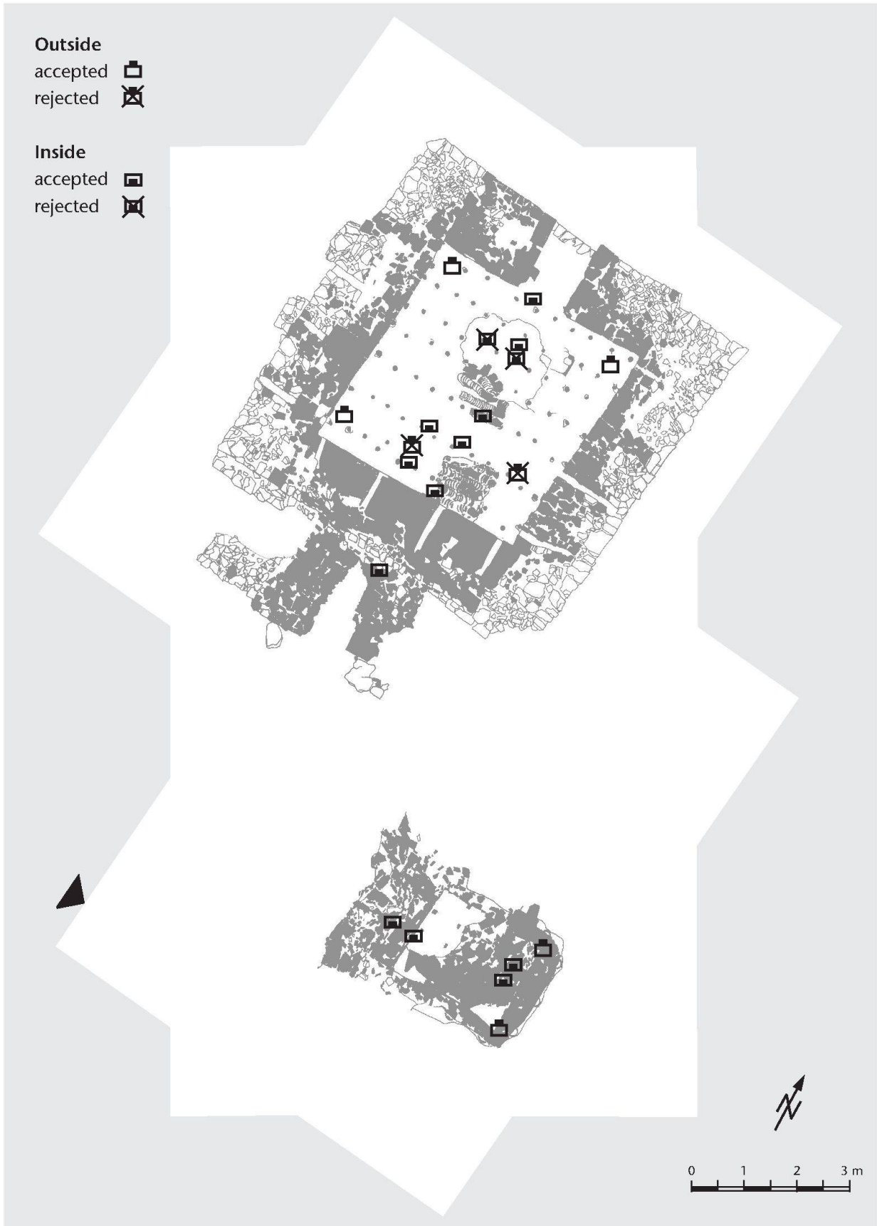
Fig. 2: Kaiseraugst, Liebrüti. Plan of the two tile kilns within the protective building (bright area), showing location of archaeomagnetic samples. Scale 1:100.