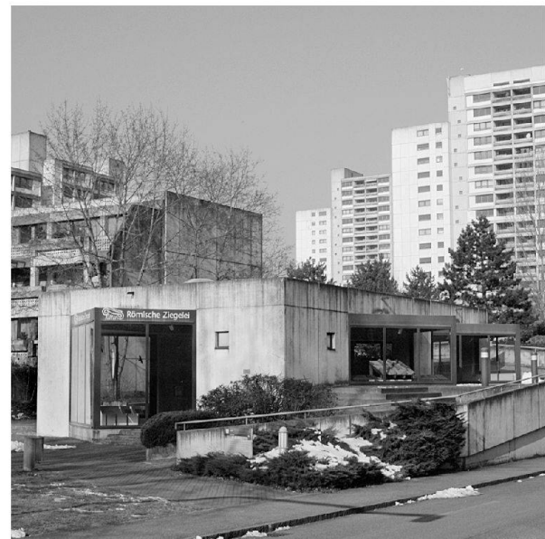
Fig. 1: Kaiseraugst, Liebrüti: "Tile works". The steel structure (dark window frames) of the protective building over the two tile kilns of the fortress garrison (with an exhibition on tile making).

Archäologische Forschung, Archäomagnetik, Datierung, Kaiseraugst/AG, Ziegelbrennöfen.