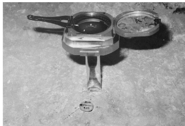
Fig. 3: Kaiseraugst, Liebrüti, tile kilns. Sampling of the floor of the large tile kiln using the glued-disc technique. Orientation of the specimen using a geologist's compass and a plastic distance piece.

Adopting an approach based on Bayesian statistics the programme REN-DATE 10 was used together with the smoothed French archaeomagnetic reference curve (REN-CMT) to date the large kiln 11 . Because of the narrow loop