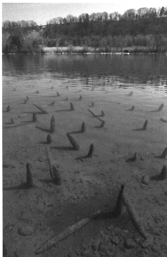
Fig. 2. Horizontal eroded wood preserved on the surface of the soil, Vully-les-Lacs VD-Montbec.

In the case of prehistoric pile dwellings around the Alps, preparation of the nomination dossier mobilized researchers to assess their state of knowledge and contribute to synthetic research. There were associated publications and museum exhibition displays linked to that purpose. Five years after inscription however, there is a concern that the synthetic research undertaken for inscription, while immensely successful, may have been achieved at the cost of continuing field investigations, especially on actively eroding sites.