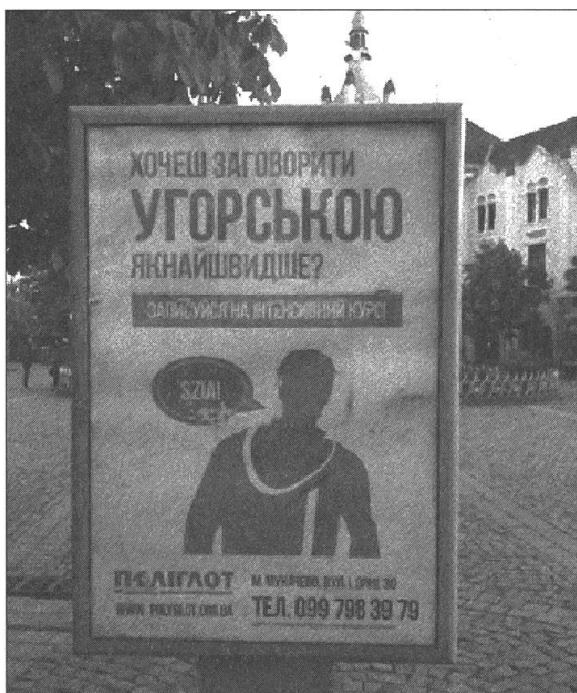
Figure 2: Poster advertising a Hungarian language course in Mukacheve (May 2016)

the responsibility of the Ukrainian central or regional government and/or administration. A telling example is the erection of the statue of Taras Shevchenko, a Ukrainian national poet, in Berehove. According to István Grezsa's evaluation, the financial subsidies from Hungary have contributed to the fact that «today Hungarians in Transcarpathia are an unavoidable political factor».