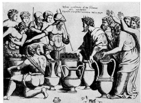
Fig. 32 Engraving after the fresco in the Vatican By Giovanni Antonio da Brescia.