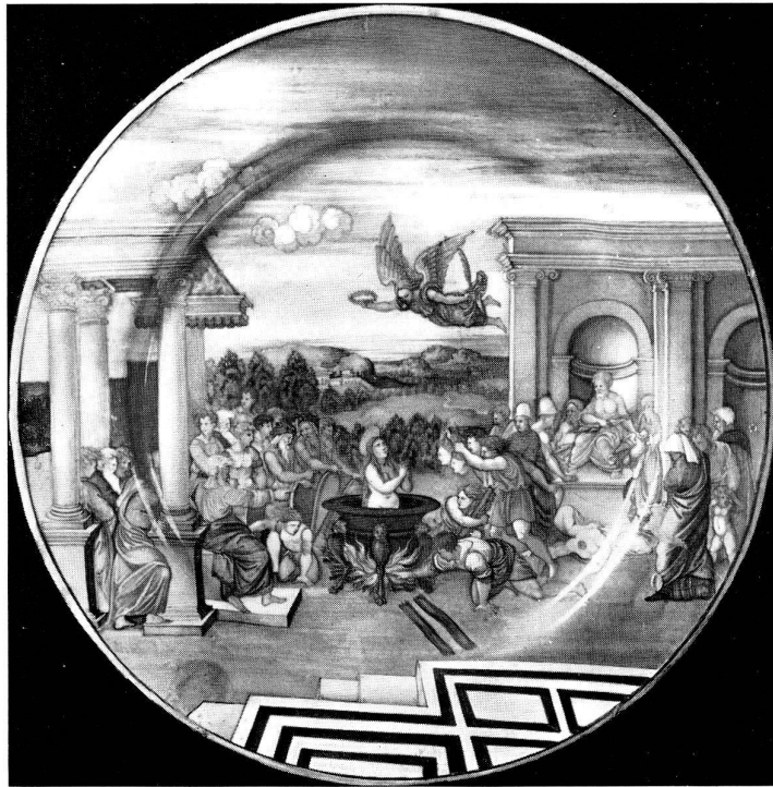
Fig. 30 Disb, The Martyrdom of St Cecilia. By Nicola Pellipario. Signed «NICHOLA» (in monogram) and inscribed «I historia de Sancta Cecilia la quale e fata in botega de guido da castello durante In urbino 1528». Diam. 50.0 cm. Museo Nazionale, Florence.