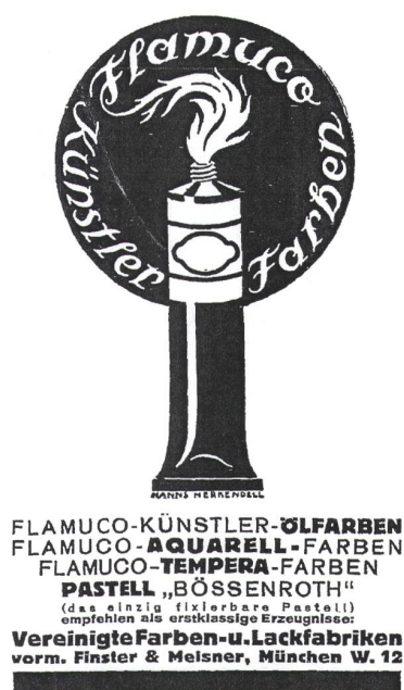
Fig. 4 Advertisement of Vereinigte Farben- und Lackfabriken vormals Finster und Meisner (The Unified Paint and Enamel Factories formerly Finster and Meisner), 1927. (Reproduced from Technische Mitteilungen für Malerei 43(1), 1927, p. 11.)

mentioned in the photographic literature around 1905. Unlike many earlier inventors, Buss made strict distinctions between the function of a binding medium and that of a photosensitive layer. He worked out a method to prepare only the binding medium, a casein (a natural emulsion of milk fat in water) layer, which was described in an article in the Journal of the Society of Chemical Industry as follows: