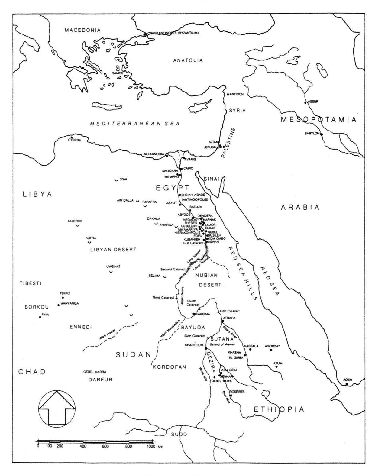
Fig. 3. The Nile Valley. From Sylvia Hochfield/Elizabeth Riefstahl (eds), Africa I. Antiquity. The Arts of Ancient Nubia and the Sudan, The Essays (Brooklyn, N.Y. 1978) map 1.