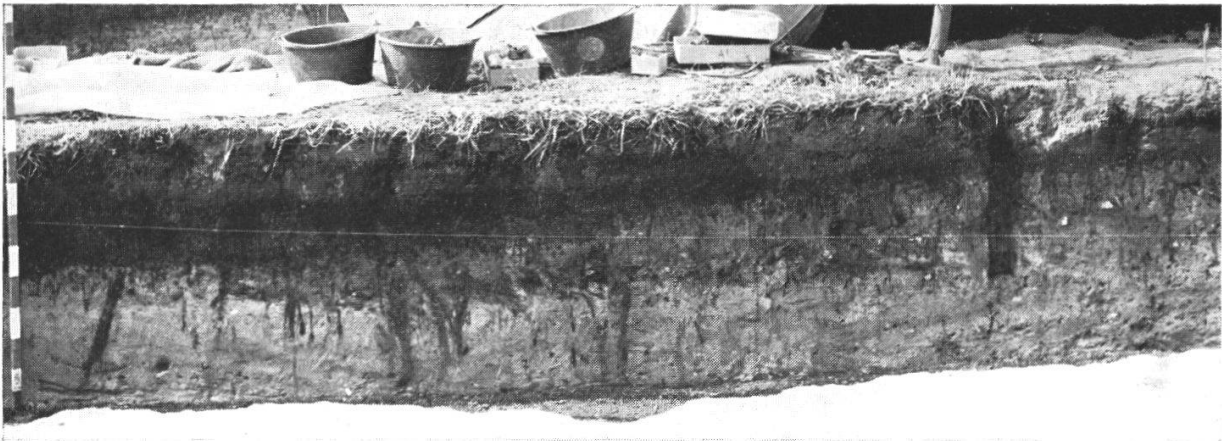
Fig. 2 Photo of Profile showing Ice Wedges

The wedge-shaped features in the profile are ice-wedge pseudomorphs ( Pseudo-eiskeile ), shown in Fig. 1 and 2. Ice wedges are formed only under conditions of