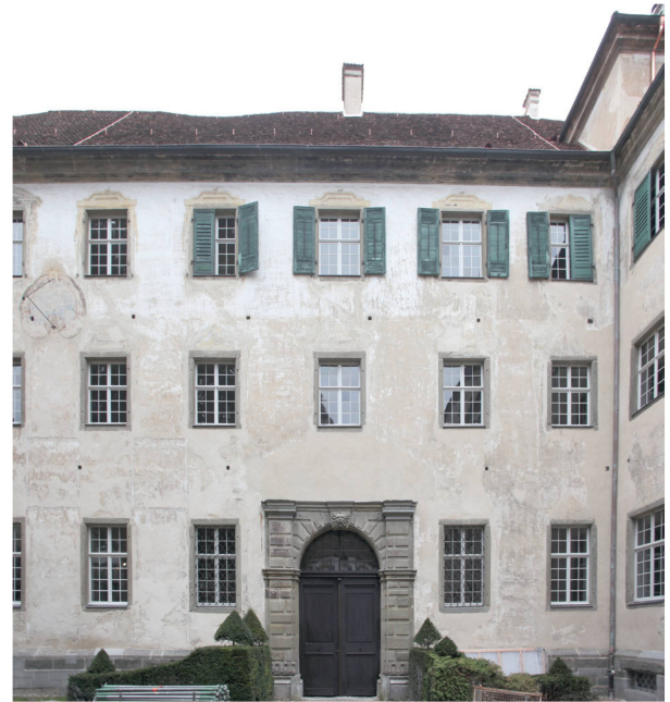
3 Façade of the eastern court (Sternenhof) after restoration 2011.

In accordance with the people in charge from the owner's side, organized in the Lenkungsausschuss and the heritage administration we planned and carried out a proof of concept for a restoration of these facades, maintaining all painted areas and areas with original lining. This once more limited replacement of partly very severely damaged stones, and their replacement could only be done within the plinth and a few sills in areas with no lining left what so ever. The rest had to be done the same way as a few years earlier, now with a more intense treatment of the flaking areas with regard to stabilization and the reduction of