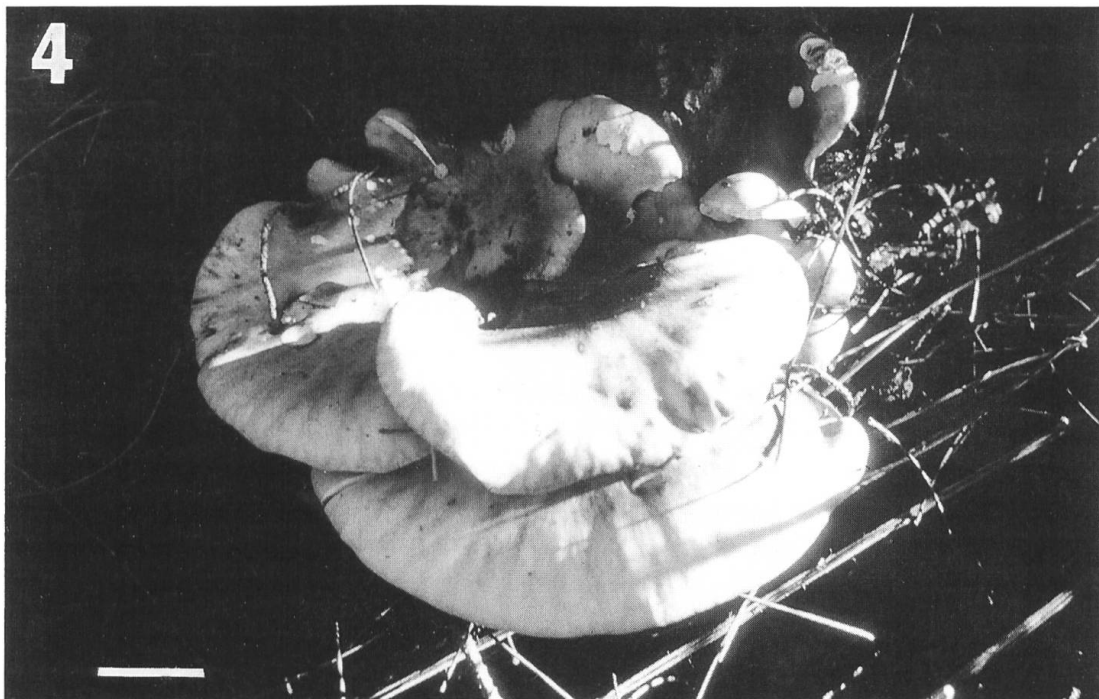
Figure 4. O. nidiformis (OKM 2404) light form with nearly white margin and dark brown near point of attachment. – Bar = 3 cm.