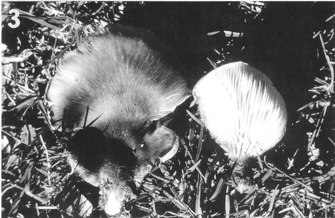
Figure 3. O. nidiformis (OKM 23886, VT 1946) dark brown form with appressed radially arranged surface fibrils. – Bar = 1 cm.