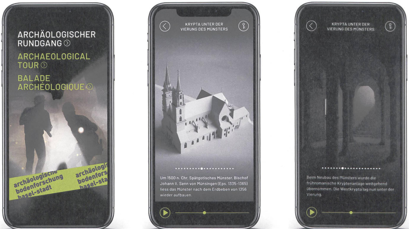
Fig. 5: Archaeological Tour – 3000 Years of Cathedral Hill History app in three languages along with informative images.

Society's demands on archaeology have changed over time. It is no longer enough to invoke legal provisions to safeguard cultural heritage or to target outreach activities to a specialist public. The general public needs to be reached as well. At the same time, attention must be paid to attractive, modern outreach based on science. In this way, policymakers will ultimately also be made more aware of the importance of archaeological sites as sources of historiography. ■