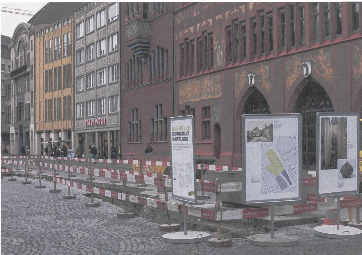
Fig. 2: Archaeology in front of Basel City Hall.

In order to increase its visibility both in the public sphere and with respect to other cultural institutions, the Archäologische Bodenforschung partnered with New Identity Ltd. to create a modern corporate design. In organisational terms, the agency gave more weight to public relations by creating an «outreach» department at the expense of other activities. The department currently has about 14% of the agency's human and financial resources at its disposal. The corporate design is now consistently applied in all public relations activities and publications. It is based on barrier tapes, such as those used by the fire brigade or police at the scene of an incident. The coloured tapes indicate that the detailed documentation of a historical «crime scene» is in progress. In 2010, the design and content of the annual report – previously large an anthology of