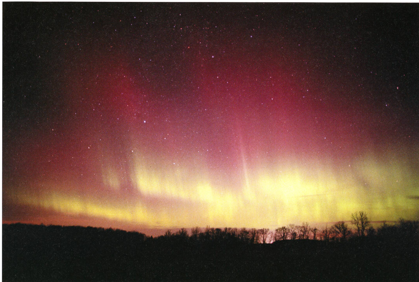
Fig. 1: 0437 UTC Film: Fuji NHG II (ISO 800) Canon F1, Canon 24/1.4L @ f/1.4, 20-30 seconds.

This aurora was the result of a moderate flare that propagated a coronal mass ejection (CME). This CME had a magnetic field orientation and strength sufficient to open up that of the Earth to produce aurorae into low magnetic latitudes.