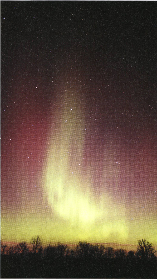
Fig. 2: 0537 UTC Film: Fuji NPZ (ISO 800) Canon F1, Canon 24/1.4L @ f/1.4, 20-30 seconds.