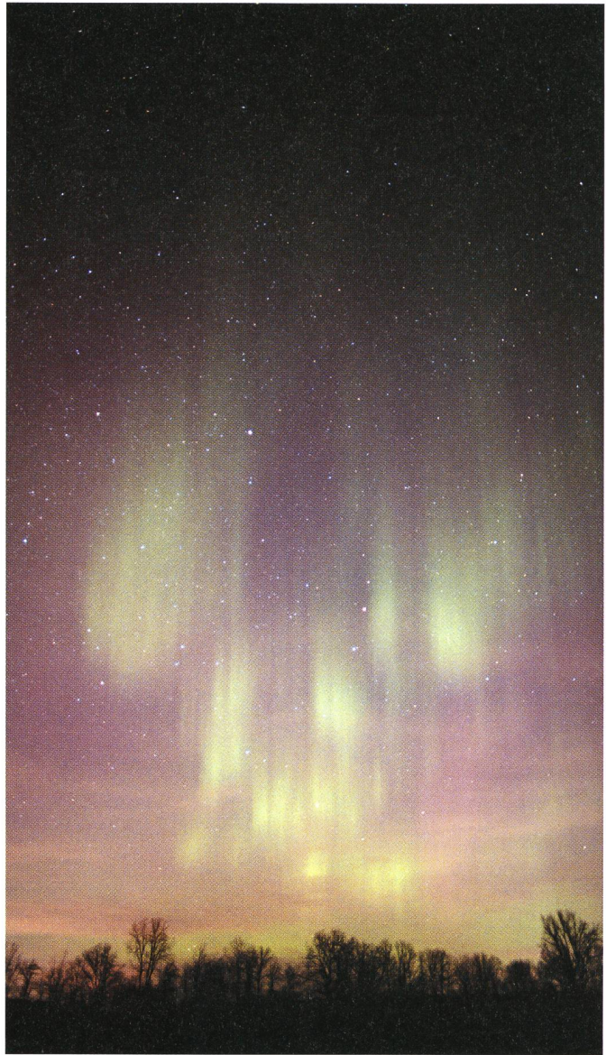
Fig. 3: 0858 UTC Film: Fuji NPZ (ISO 800) Canon F1, Canon 24/1.4L @ f/1.4, 40-50 seconds.