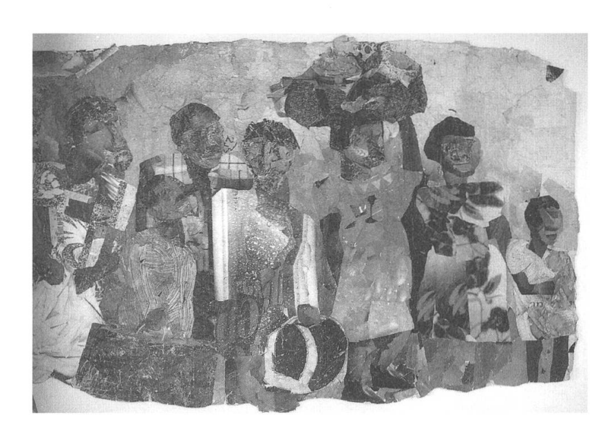
4 Kay Hassan, Flight (Detail), 1995

economy that benefits, and is perpetuated by, corporate power. What is clear is that institutional interests and functions – whatever they may be – mitigate the supposed freedom its spaces offer.