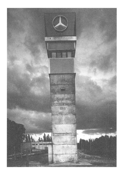
7 Hans Haacke, Freedom is Now Simply Sponsored – from Petty Cash, 1990

cash: 'During the years of apartheid, the company supplied the South African military and police with more than 6,000 vehicles, including rocket launchers, in spite of an international arms embargo'18 (fig. 7). For that work, Haacke placed a large neon Mercedes star atop an old GDR watchtower located in the no-man's land of the old Berlin Wall. In so doing, he re-associated the company's logo, also seen over its headquarters on Berlin's commercial Kufurstendam avenue, with the corporation's historical relation to police brutality (symbolized by the baleful watchtower). Haacke's research revealed that Daimler-Benz also supported Nazi Germany with military materials, supplied vehicles to Berlin's oppressive police force in the '70s, and sold helicopters, military vehicles and missiles to Iraq in the '80s.