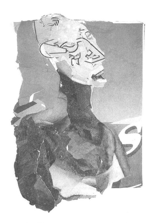
5 Kay Hassan, Untitled, 1999

Hassan has stated in regard to his paper constructions that he desires to 'reclaim the mask from Picasso'. Not only does this comment indicate an intention to assault the history of primitivist assumptions with which the European avant-garde defined and appropriated the material objects of African cultures; his paper constructions also suggest that such a subversive project of reclamation and decolonization