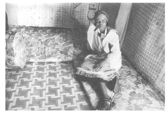
2 Zarina Bhimji, Untitled, 2000