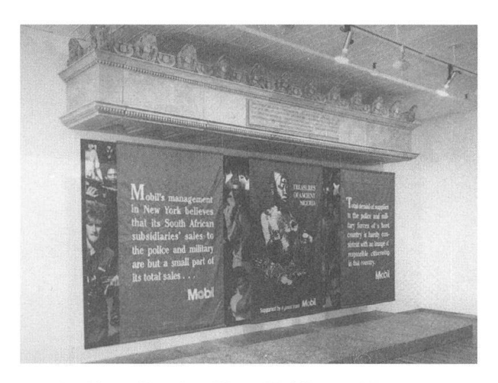
6 Hans Haacke, MetroMobiltan, 1985

many ways it is artistically very different from Hassan's – because it has also critically examined South African apartheid as well as the neo-colonial multinational power that supported it. <sup>13</sup> Consider Haacke's MetroMobiltan of 1985, for instance, which exposes Mobil Oil's dealings in South Africa during apartheid (fig. 6). Like a giant corporate advertising display, the installation features banners with statements from Mobil's marketing