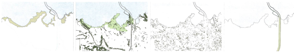
landscape structure diagrams