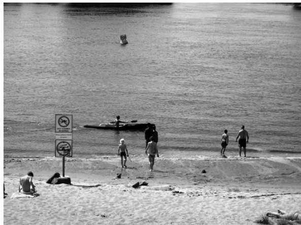
figure 2: Mapping the "Dike Park". Source: osp urbanlandschaften figure 3/4: Existing Activities in the "Dike Park". Photos: Antje Stokman