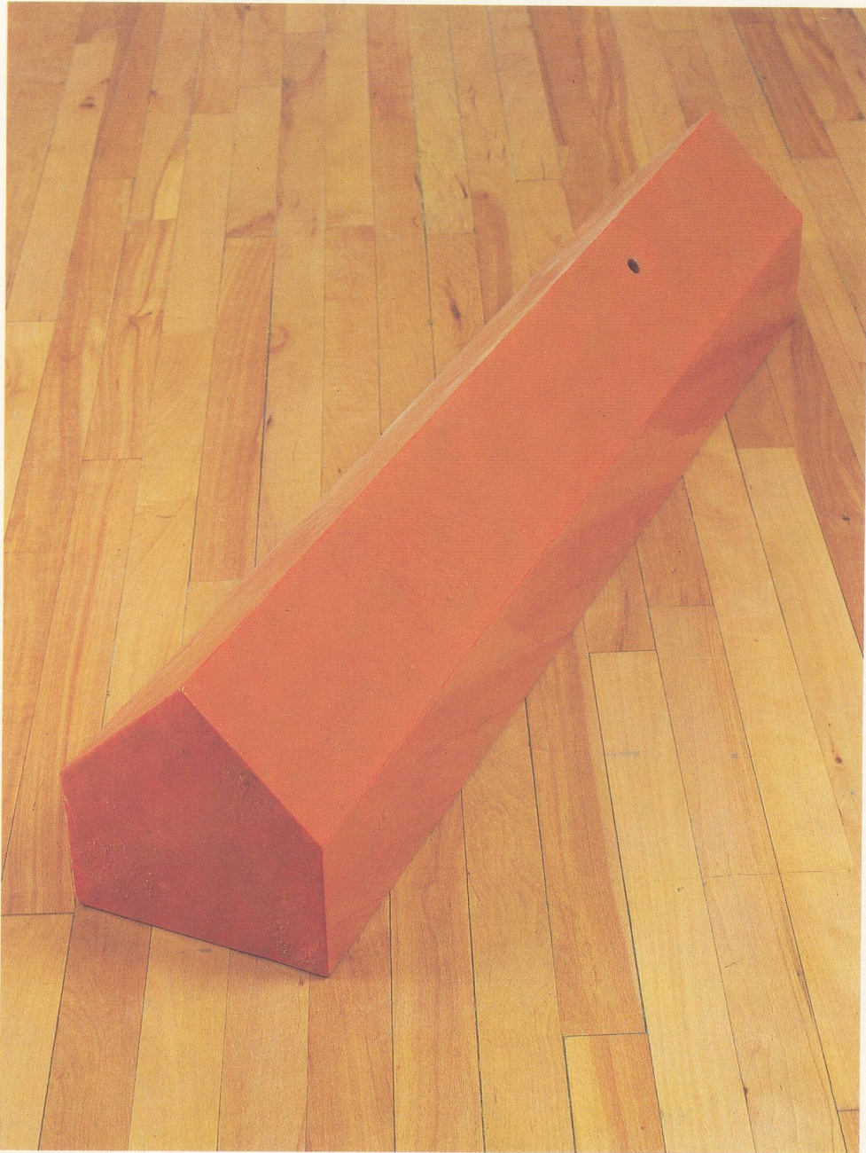
Rice House, 1990. Sealing wax, wood and rice, 8 7/8 x 8 1/8 x 44 in.

SPERONE WESTWATER 142 Greene Street New York 10012 212 431-3685 (fax) 941-1030