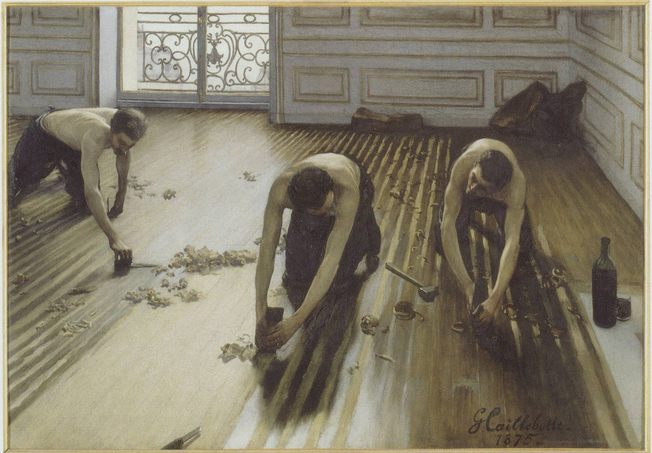
GUSTAVE CAILLEBOTTE (1848-1894), RABOTEURS DE PARQUET, 1875, MUSÉE D'ORSAY, PARIS.