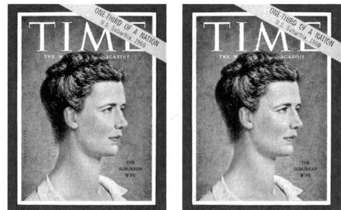
Time Magazine June 1960: The perfect housewife

even with its journalistic tone, satirizes the figure of the women in suburbia: «With the children on her mind and under her foot, she is breakfast getter («you can't have ice cream for breakfast because I say you can't»), laundress, house cleaner, dishwasher, shopper, gardener, encyclopedia, arbitrator of children's disputes, policeman («Tommy, didn't your mother ever tell you that it's not nice to go into people's houses and open their refrigerator»).