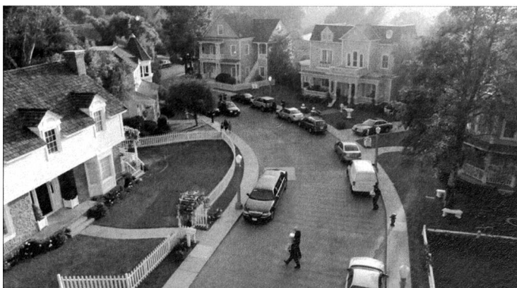
Obsequies in a cul-de-sac