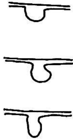
Fig. 1. Round and oval aneurysms.