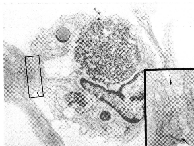
Fig. 2: Pulmonary intravascular macrophage. X15000. Insert: Intercellular junction of a pulmonary intravascular macrophage.