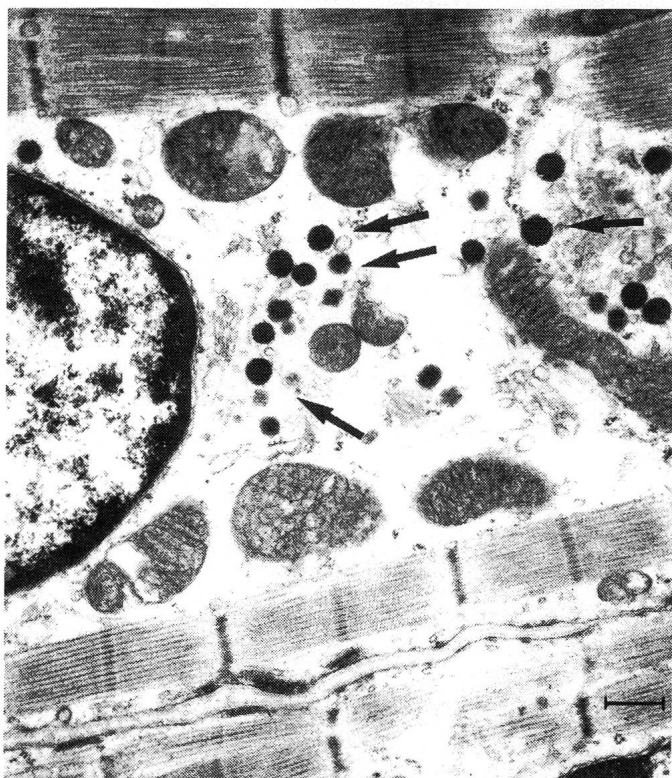
Fig. 1: Electron micrograph, left auricle, rabbit. Atrial specific granules (arrows) are typically found at the nuclear poles. Bar = 0.40 \mu m.

Immunohistochemical studies at light and electron microscopic levels carried out in man and rat, showed that these granules contain bioactive polypeptides, referred as Atrial Natriuretic Peptide (ANP) or Atrial Natriuretic Factor (ANF), involved in water-electrolyte