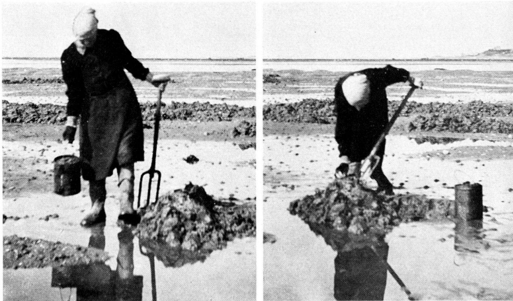
Fig. 1. Digging lug worm on the sea-shore north of Esbjerg, Jutland. The pictures show the heavy fork, length about 140 cm., and a bucket for holding the worms, instead of the old-fashioned wooden box. Behind the digger is seen an orme-groft (worm-ditch). Photography T. Tobiassen 1942.