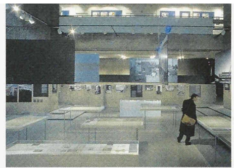
1 a and b «Saving Corporate Modernism» at Yale University, 2001