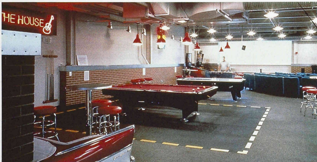
2 «Chill Out Room» of Stanmyre Noel Architects, 2000

As I sit on the train writing this article on my laptop, taking over the seat next to me for my desk, I ignore the view so that I can gaze endlessly into this screen and then send the article via email to Switzerland. Glamorous? Is it that our jobs require that we must be more mobile and simultaneously complete our work? Or is it because our equipment allows us to be mobile so that we do travel for work? In either case designers are seeking ways to improve the physical environment so that we don't get repetitive motion syndromes, can interact with co-workers, be productive and creative, and maybe take a moment to gaze out the window.