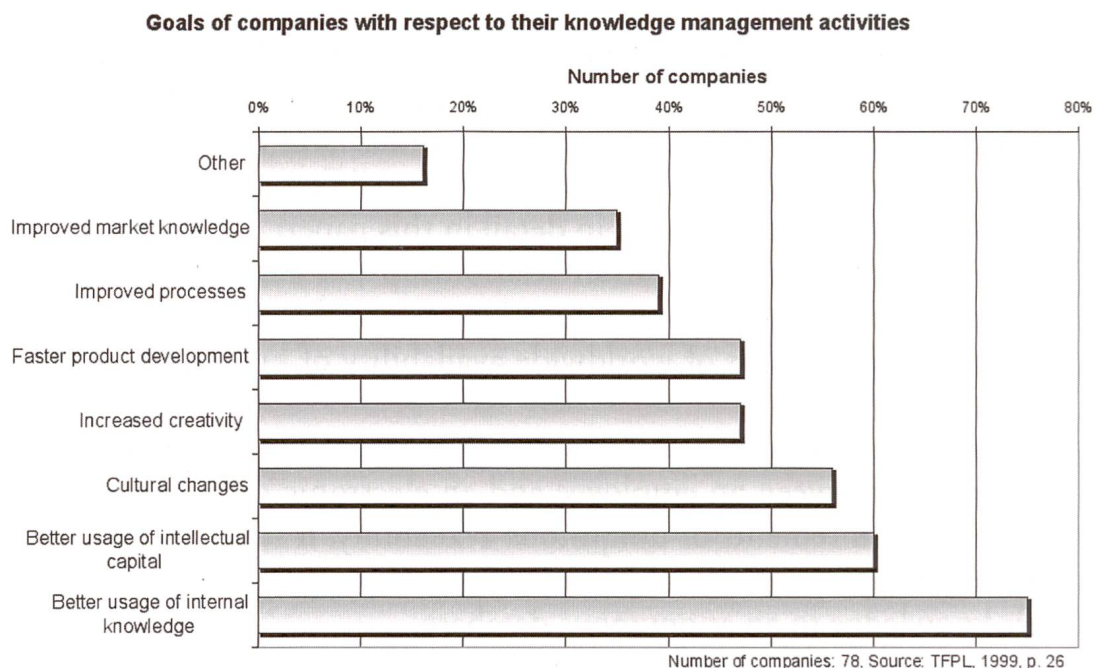
Figure 1: Goals in Knowledge Management Initiatives

Empirical data suggests that a majority of knowledge management initiatives aim at the usage of existing knowledge (Fig. 1).