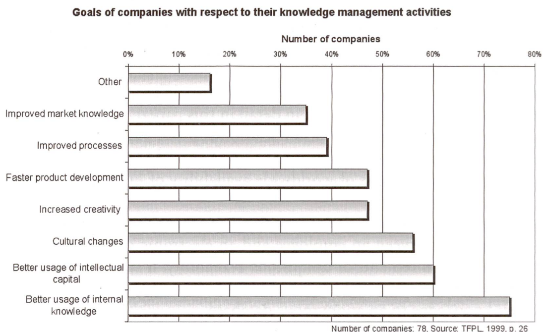
Figure 1: Goals in Knowledge Management Initiatives

Empirical data suggests that a majority of knowledge management initiatives aim at the usage of existing knowledge (Fig. 1).