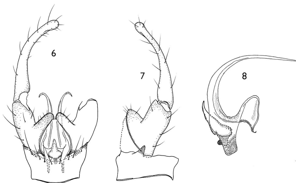
Figs. 6-8. Trichocera (Trichocera) tenuistylus sp. n. (holotype). 6-7: general view, ventral (6) and lateral (7). 8: aedeagal complex, lateral.

mutica . Halteres whitish-yellow, reaching distal margin of abdominal segment 3. All legs are broken in the holotype so that length of tibial spurs and tarsal claws could not be determined.