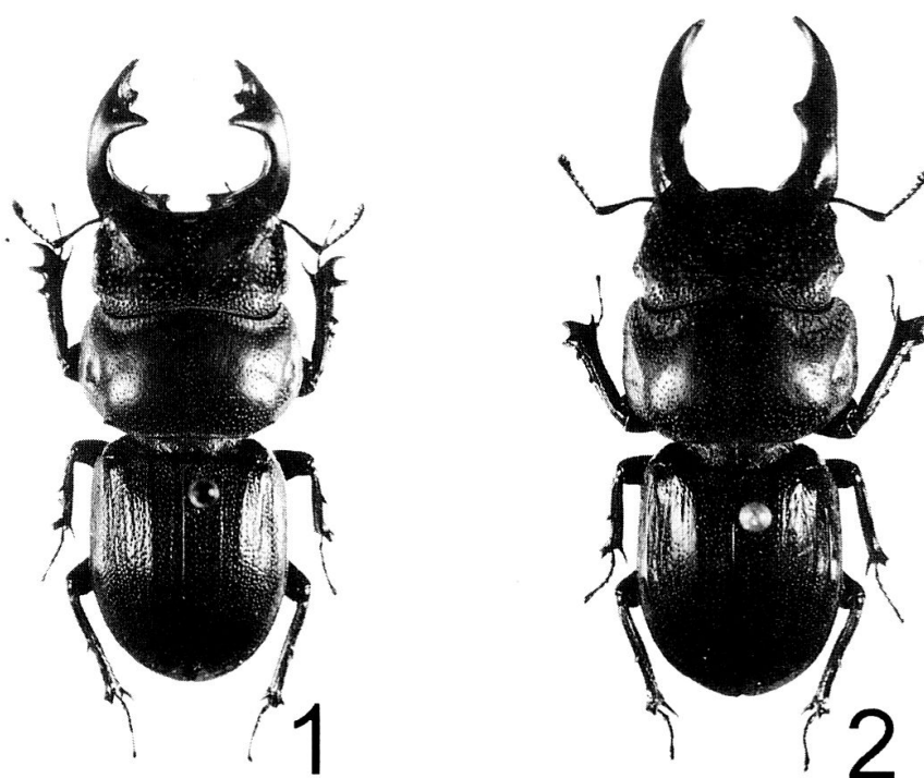
Figs. 1-2. – 1: Habitus of a large male of Hoplogonus bornemisszai n.sp. – 2: Habitus of a large male of H. simsoni PARRY.

upwards; surface covered with longitudinally arranged punctuations, with three or four irregular, smooth discal costae; scutellum very small. Wings absent.