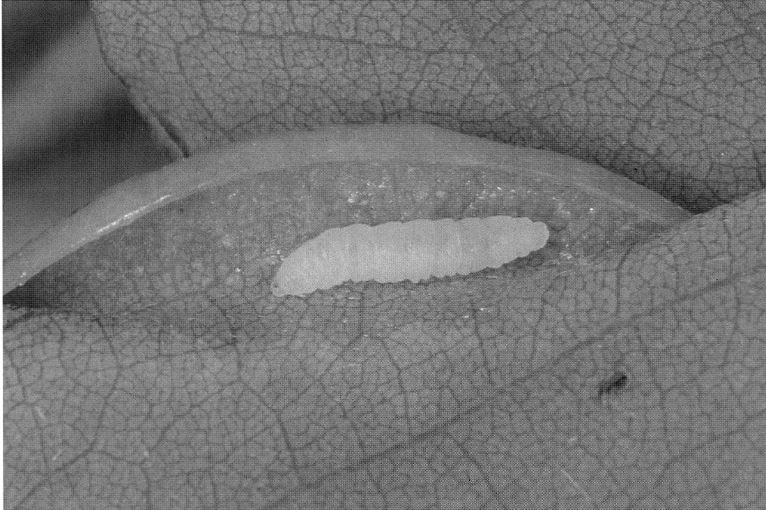
Fig. 2. Opened gall with larva of Obolodiplosis robiniae .