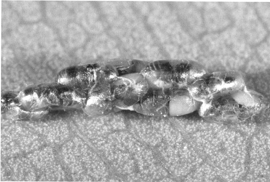
Fig. 3. Cocoon cluster of a new parasitoid, i.e. Platygaster robiniae , comprising fully developed wasps collected from Obolodiplosis robiniae galls at Birmensdorf (7.ix.2007).

(record #4) show its wide distribution in Switzerland. Most probably, it is present in low densities in most of Switzerland.