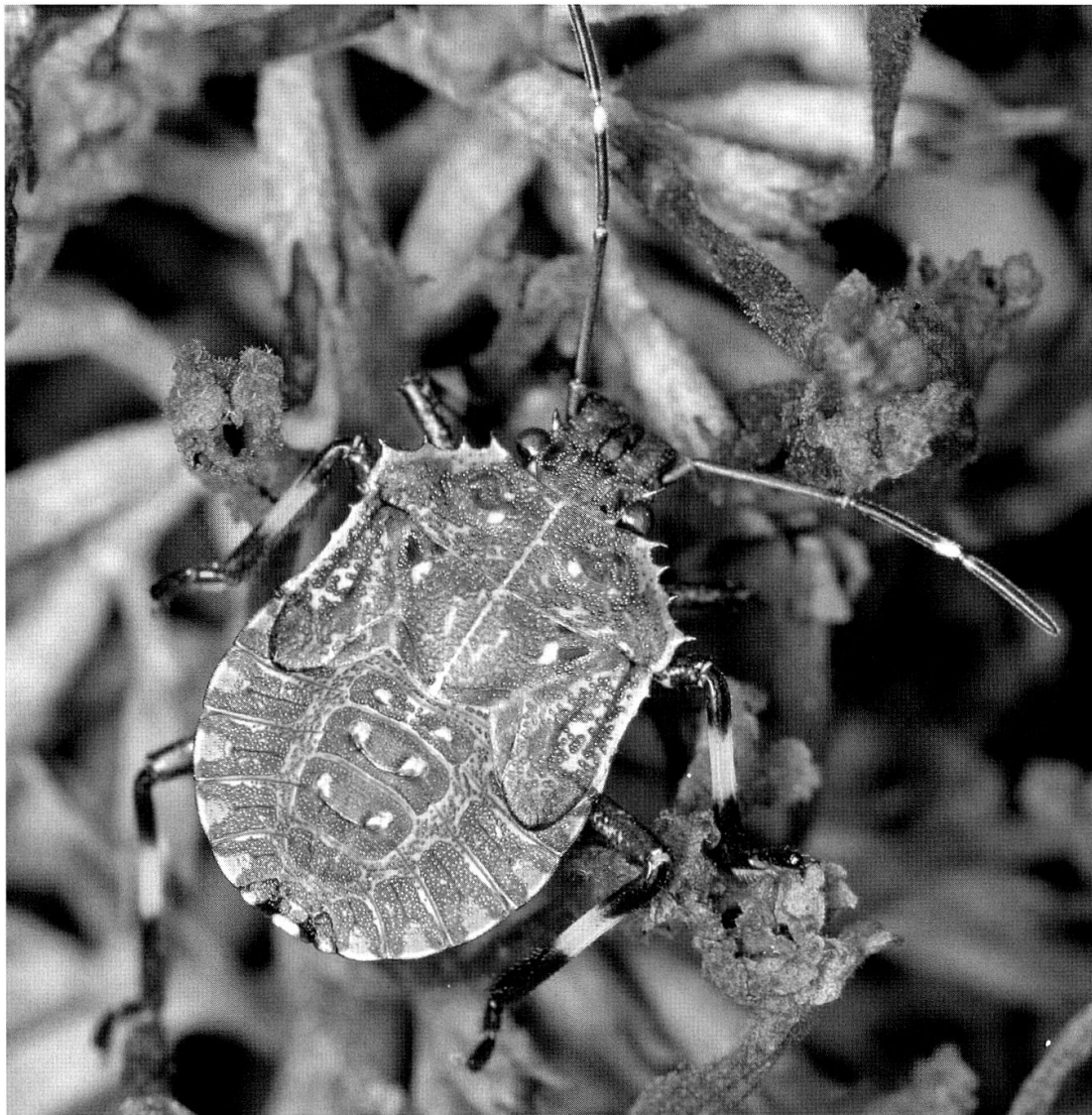
Fig. 2: 4th instar nymph of Halyomorpha halys with spines on the pronotum and white bands on the tibiae.

The literature on this invasive species available in English is quite scarce because the insect has only recently been found outside East Asia. Most information presented here relies on the literature review by Hoebeke & Carter (2003) and on data from the first studies done in Allentown, PA in the USA after the positive