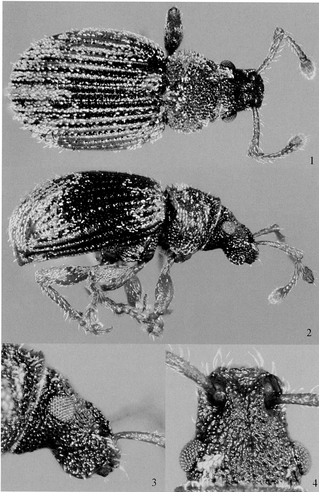
Figs 1–4. Amicromias tricholepis sp. n., male. (1) body dorsal view; (2) body lateral view; (3) head lateral view; (4) head dorsal view.