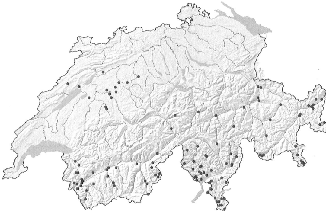
Fig. 1. Finding sites of Simo hirticornis (Herbst, 1795) in Switzerland.

den, Neuchâtel, Schaffhausen, Solothurn, Ticino, Vaud, Valais), S. hirticornis in 8 cantons (Bern, Freiburg, Graubünden, Neuchâtel, St. Gallen, Ticino, Vaud, Valais).