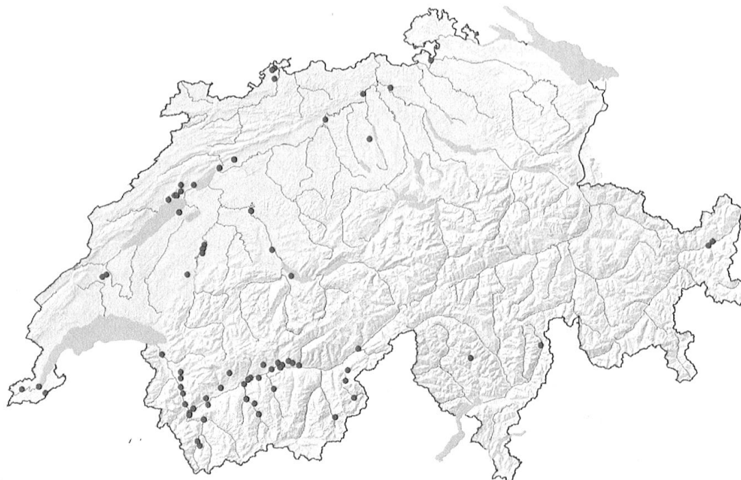
Fig. 2. Finding sites of Simo variegatus (Boheman, 1843) in Switzerland.