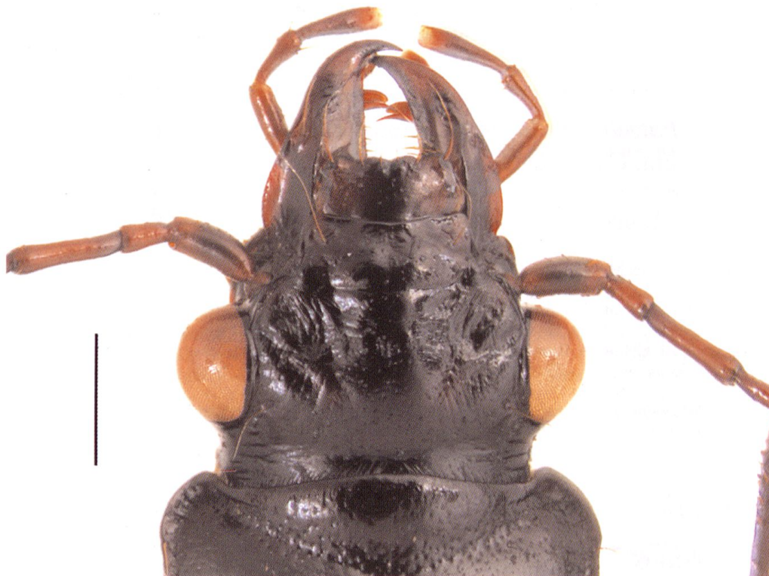
Fig 1: Head of Nebria (Patrobonebria) megalops sp. n. Scale bar: 1 mm.

The photographs were made with a digital camera Leica DFC 425, and the images were processed by the automated multifocus software (Imagic Image Access, Version 10).