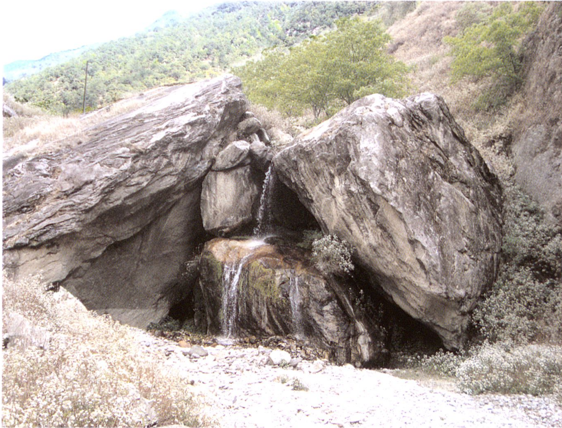
Fig 4: Habitat of Nebria (Patrobonebria) megalops sp. n. near Da Po Qing village near Dali/Yunnan (China).