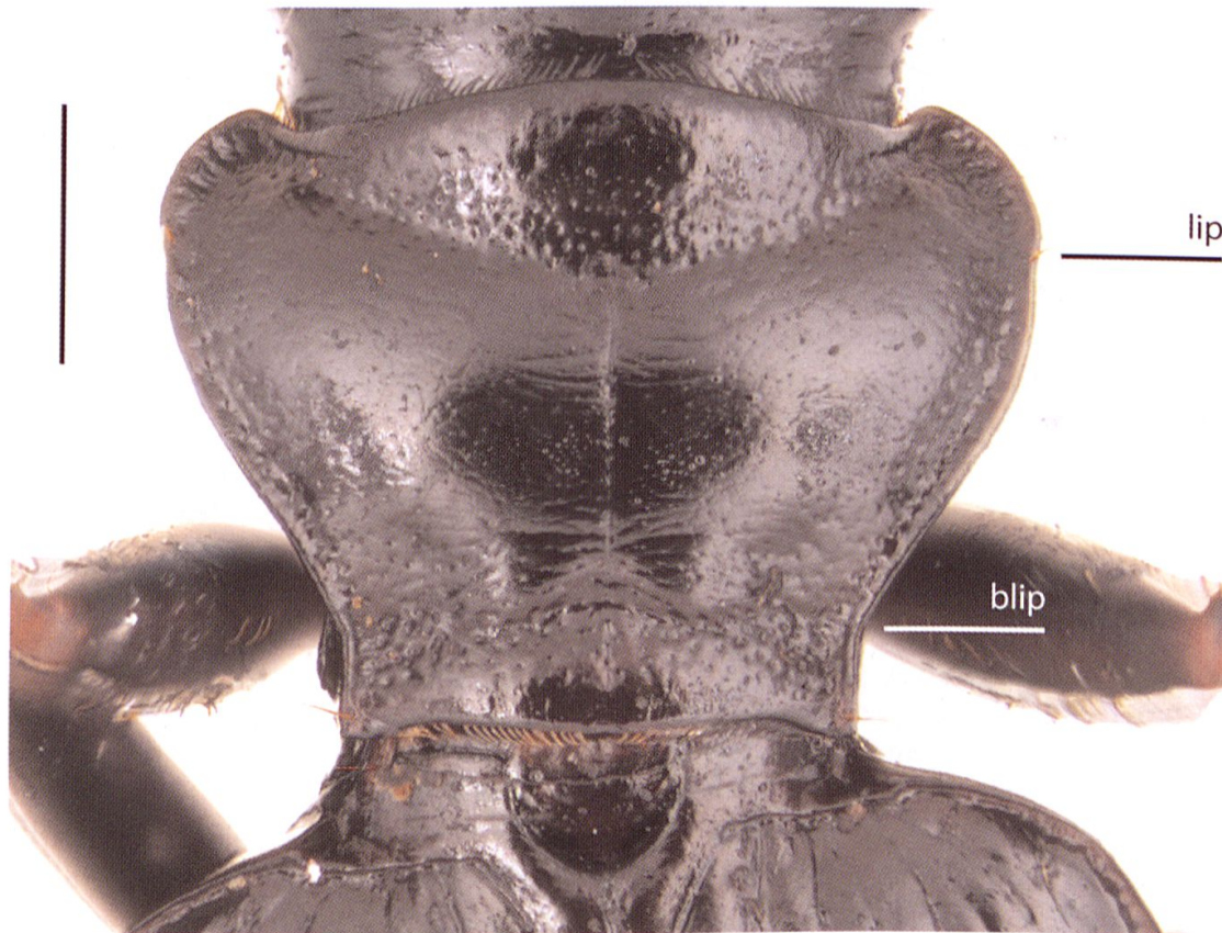
Fig 2: Pronotum of Nebria (Patrobonebria) megalops sp. n. lip: lateral impression of the pronotum; blip: basolateral impression of the pronotum. Scale bar: 1 mm.

punctate. Hemispheric eyes very prominent. Temples long, regularly rounded towards the neck. Antennae long and slender, extending to the middle of the elytra. Antennal scape subcylindrical, basally narrowed, shorter than the eye's diameter, with 1 dorsal seta (rarely bisetose). 4th antennomere only with an apical collar of long setae and only few additional short setae. Ligula blunt with 2 long setae apically. Maxillary stipes basolaterally with 5–7 robust setae. Penultimate labial palpomere bisetose. Mentum with bifid medial tooth. Submentum with a row of 4–8 setae. Microsculpture of the head isodiametric.