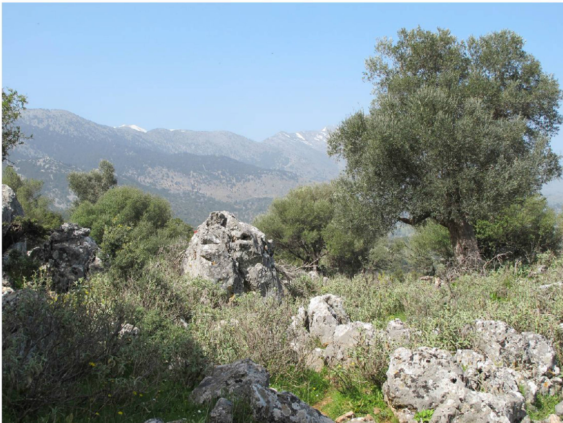
Fig. 1. Habitat of Stomodes letzneri Reitter, 1889 within an olive grove on Crete, Krapis, 7 th April 2012.

On a joint entomological excursion together with Lepidopterologists, Crete Island was visited from 5th to 14th April 2012. The focus was set on the western province Chania, and there mainly on an area along a north-south axis at the foothills of the Lefka Ori massif. With different collection techniques (hand catches on plants, beating tray, sweeping and sifting), more than 88 taxa of Curculionoidea were collected, among them three female specimens of a member of the genus Stomodes Schoenherr, 1826 with the indications given in the following: