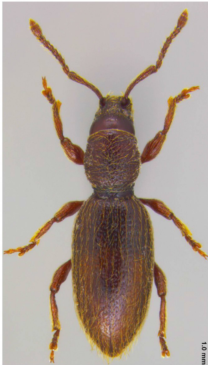
Fig. 2. Habitus of Stomodes letzneri Reitter, 1889, Crete, Chania, S-Alikambos, Krapis.

It was Wagner (1912) who made the last revision of Stomodes . Presently the genus includes 13 taxa (11 species and two subspecies) in the Palaearctic realm