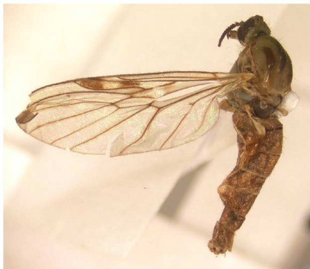
Fig. 2. Sylvicola stackelbergi from Austria, top view.