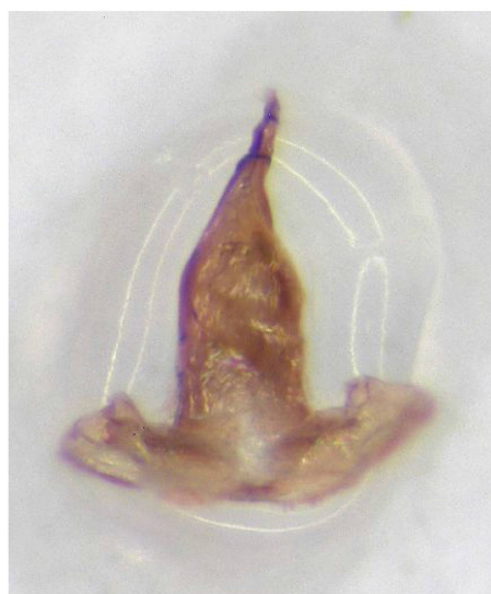
Fig. 4. Sylvicola stackelbergi from Austria, genital fork.