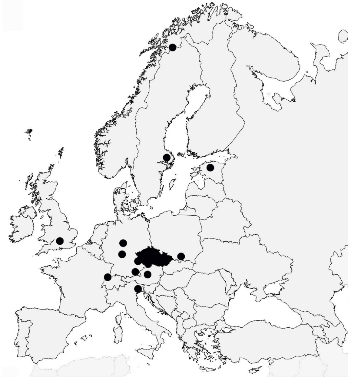
Fig. 1. Collecting localities in 2006 and 2007.

Czech Republic), a description of the locality including biotope and date of trap exposure. Localities from 2006 published by Dvořák (2007) are designated as «06» in the text, localities from 2007 published by Dvořák et al. (2008) are designated as «07» in the text. Unpublished localities are designated here by their respective years.