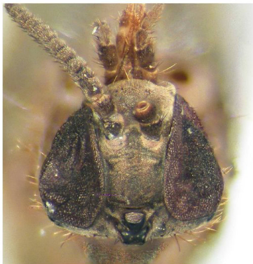
Fig. 3. Frons of Sylvicola stackelbergi from Austria. Photo: Zbyněk Kejval.