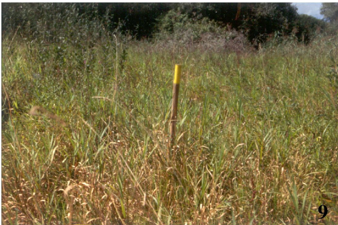
Figs. 8–9: Habitat of Parascatopse distorta sp. nov. in the Bolle di Magadino, lake Verbano, Ticino, southern Switzerland: — 8. Magnocaricetum and Filipendulion (stations 4–5). — 9. Phalaridietum (station 9).