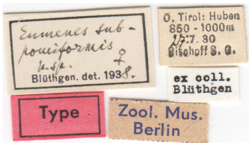
Fig. 6. Labels of the holotype of Eumenes subpomiformis Blüthgen, 1938 (MFNB coll.).

In accordance with Castro & Sanza (2009: 265) our data fail to show any genetic differences (Fig. 1) among the two morphs (Fig. 3, 5) of E. coarctatus in Switzer-