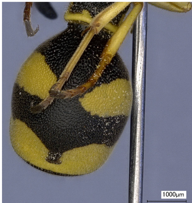
Fig. 5. Dorsal view of the tergite 2 of a female of Eumenes coarctatus (individual RN0306) (morph « lunulatus ») from Leuk in the canton of Valais.