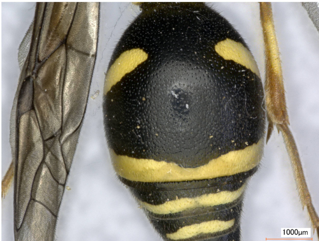
Fig. 3. Dorsal view of the tergite 2 of a female of Eumenes coarctatus (individual RN0262) (morph « coarctatus ») from Neunforn (canton of Turgovia) in northern Switzerland.