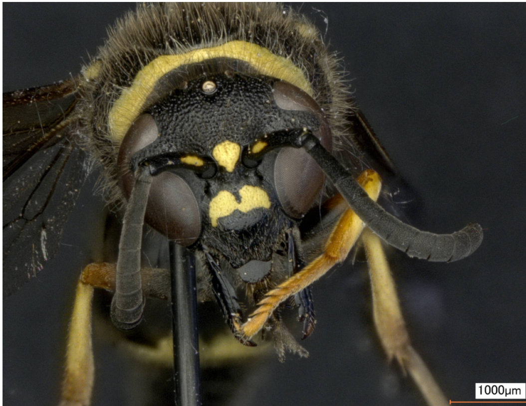
Fig. 2. Frontal view of the head of a female of Eumenes coarctatus (individual RN0262) (morph « coarctatus ») from Neunforn (canton of Turgovia) in northern Switzerland.