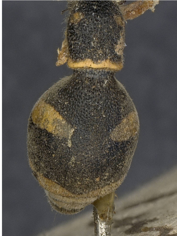
Fig. 4. Dorsal view of the gaster of the female holotype of Eumenes lunulata Fabricius, 1804 from Austria (ZMUC coll.).