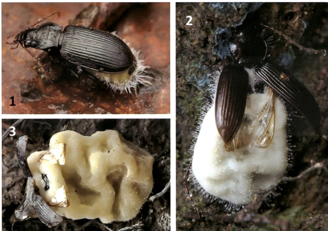
Figures 1–3. 1. Nebria brevicollis at an early stage of fungus sporulation. At this stage the beetle is still able to move its legs and antennae (nat. length of the beetle about 13 mm). 2. Beetle with fully sporulating fungus showing the extremely swollen abdomen. The strong cystidia are clearly visible at the edge of the fungus mass. 3. At the end of the sporulating period the mycelium turns yellowish.

The slide with type material contained some resting spores but no other fungal material. The resting spores were spherical, smooth-walled and measured 33.6 ( 29\text{--}41 ) \mu\text{m} ( n=35 ).