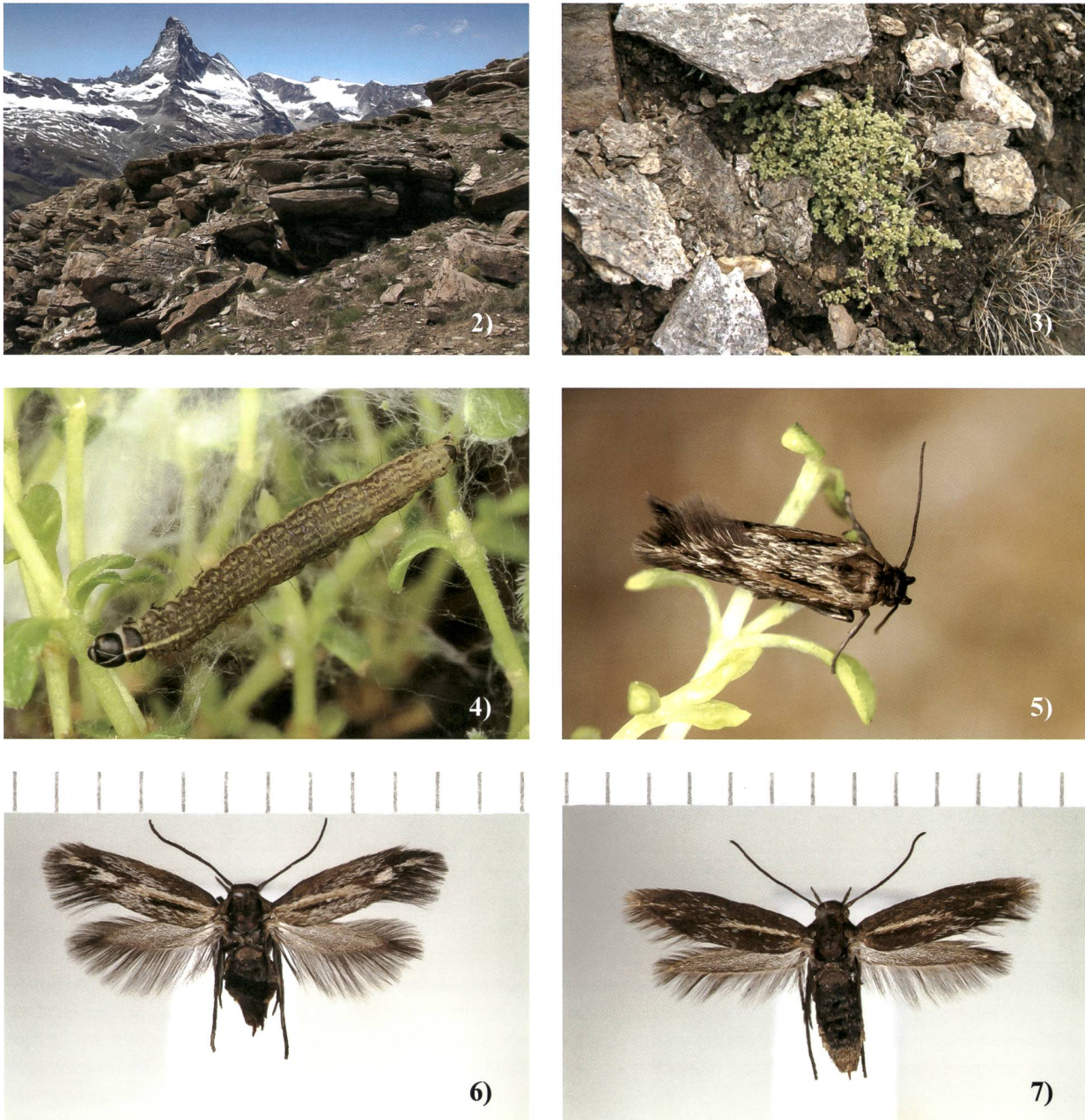
Figure 2–7. 2) Biotope, 3040m a.s.l.; 3) Herniaria alpina ; 4) Adult caterpillar; 5) Freshly emerged moth; 6) Reared moth. Scale bar unit: mm; 7) Wild moth. Scale bar unit: mm.