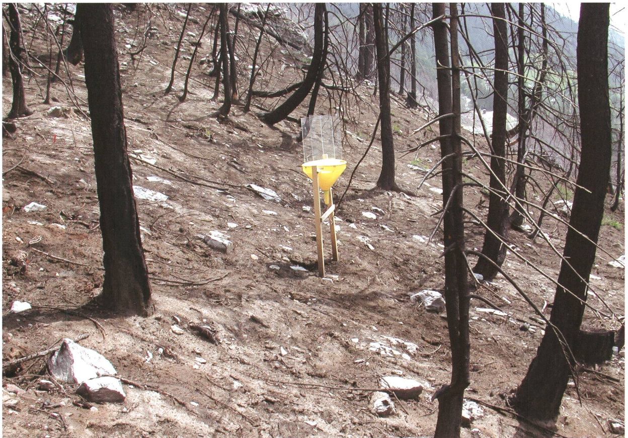
Figure 7. Combi trap in the center of the large burned area above Leuk, a few months after the fire (Forest fire II).