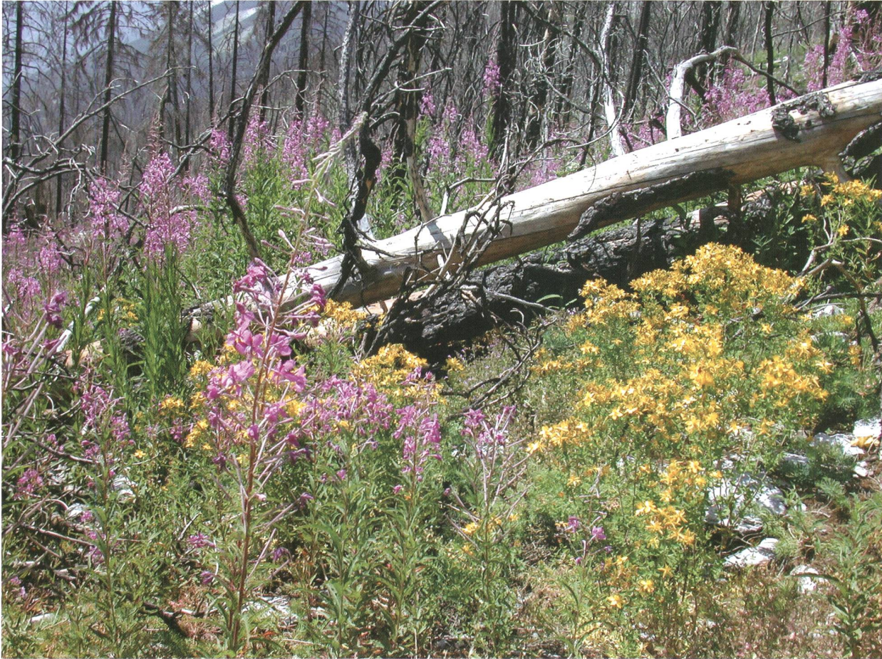
Figure 8. Two years after the massive fire above Leuk the whole area was covered with a carpet of colorful vegetation.

To quantify the positive or negative impact of disturbance on a species, the numbers were combined separately for the three treatments FO, ID, and HD for all four projects. The number of trap sites per treatment was balanced. As an indicator for the effect of disturbance in general, the following formula was used for each species: \text{mean (HD+ID)} / (\text{mean (HD+ID)} + \text{FO}) . Species with more than 66% are considered winners, those with less than 33% losers.