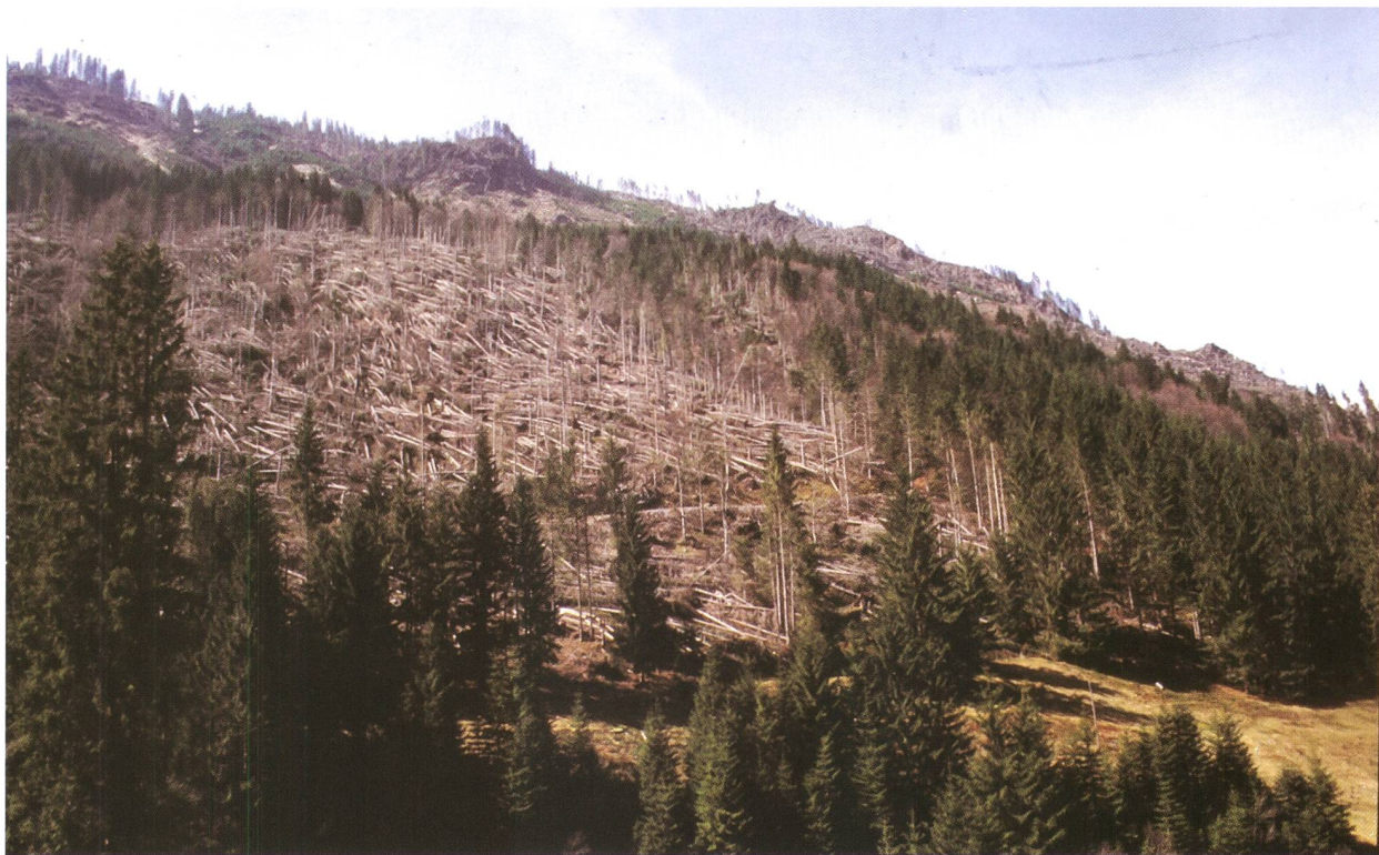
Figure 3. Large windthrow of storm Vivian in spruce forest in the Canton Glarus.