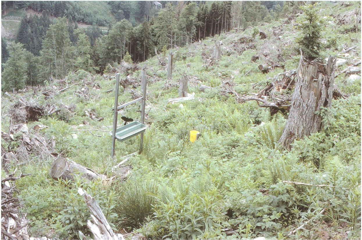
Figure 4. Cleared windthrow plot above Schwanden three years after storm Vivian (Windthrow I).

plots were used for a long-term investigation of different disturbance effects on biodiversity between cleared and uncleared windthrows. Like the disturbed plots, the control forest plot (FO) consisted of intact spruce forest with some scattered deciduous trees. The HD and ID plots had been equally affected by the storm but HD was cleared of all stems, suffering a double disturbance: windthrow and timber harvest (Fig. 4). In the ID plot the fallen trees remained untouched by harvest (Fig. 1). In the disturbed plots of 1–2 ha the vegetation cover developed slowly because of the high elevation. While in the cleared plot (HD) flowering herbs attracted pollinators and pollen feeders, the uncleared plot (ID) developed a brush vegetation of deciduous plants and young trees. The plots were sampled in 1992 (two years after the storm), 1993, 1994, 1996, 2000 and 2009. Three window traps and five yellow bucket traps were placed in each of the three plots (FO, ID, HD) at distances of at least 30 m between trap stations. The sampling periods lasted from mid May to end of September.