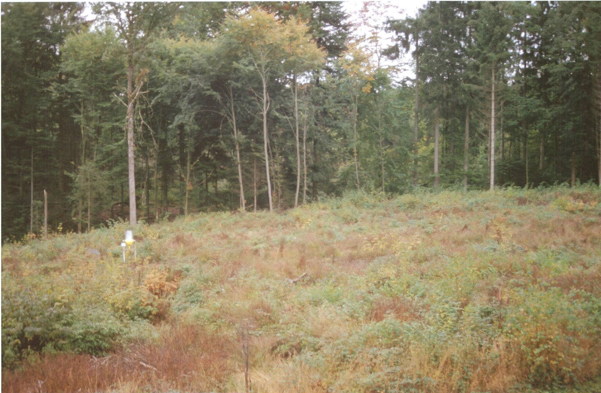
Figure 5. Cleared windthrow plot in mixed forest near Messen, two years after storm Lothar (Windthrow II).

forest; FO). All plots had similar site conditions. The same combi-traps (Fig. 6) as in windthrow project II (Lothar) were used (Moretti et al. 2006). Three traps were placed in each of the 54 plots. The minimum distance between traps at each site was ten m, while the average distance between the sites was around 300 m. The traps were emptied weekly from March to September 1997.