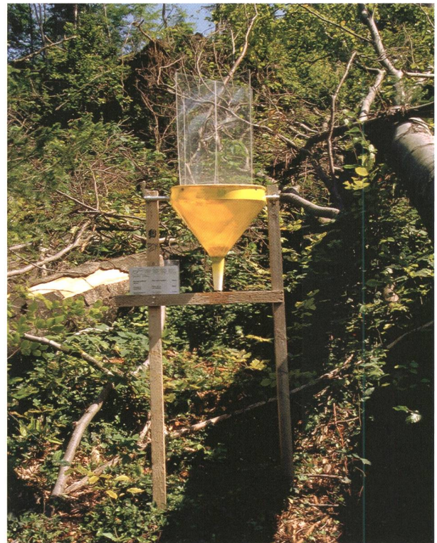
Figure 2. Combi trap (a combination of a flight interception trap and a yellow funnel trap) in an uncleared windthrow plot (Windthrow II) near Habsburg after storm Lothar.