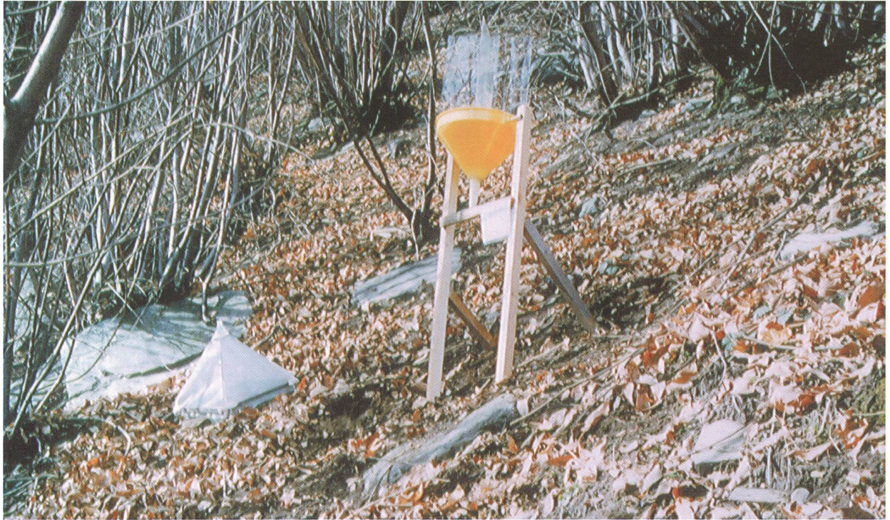
Figure 6. Combi trap in an intensely disturbed forest plot in Ticino (Forest fire I) after several forest fires within the previous 40 years. In spring the chestnut regrowth (here without old trees) is still without leaves.