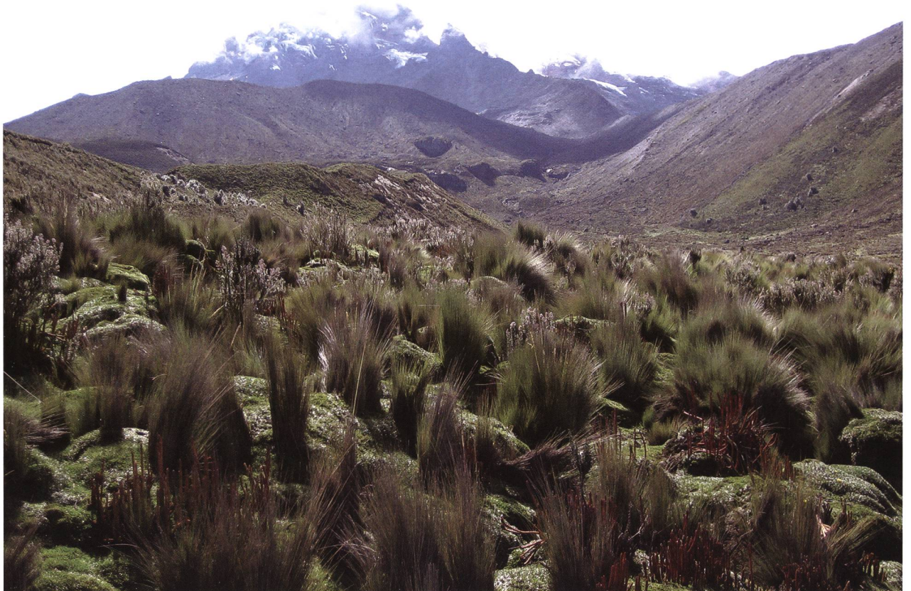
Figure 12. Habitat aspect at foothills of Chimborazo at 4100 m a.s.l.