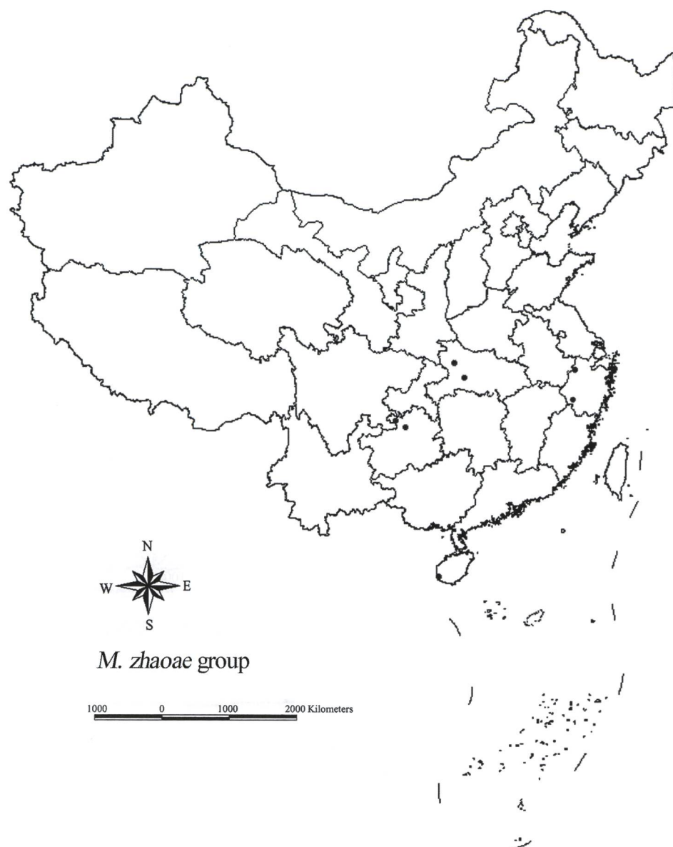
Figure 2. Geographical distribution map of M. zhaoae group in China.

tures, but with weak microsculpture. Mesopleuron less shiny, mesepisternum with dense and coarse punctures, upper half with punctures large and interspaces broad, lower half with punctures small and interspaces narrow; anepimeron dull, with coarse wrinkles; anterior margin of katepimeron very smooth and shiny, without punctures or microsculpture, posterior area of katepimeron with some shallow large punctures, dorsal half with some deep punctures; metepisternum dull, with minute and dense punctures; metepimeron less shiny, depressed area with some punctures and weak microsculpture, interspaces broader than diameter of a puncture, without metepimeronal appendage (Figure 1e). Abdominal tergum 1 shiny, laterally abdominal tergum 1 with some shallow punctures, nearly smooth submedially, basal 1/3 of abdominal tergum 1 punctured and 2/3 smooth; other abdominal terga less shiny, anterior 2/3 with some shallow punctures and weak