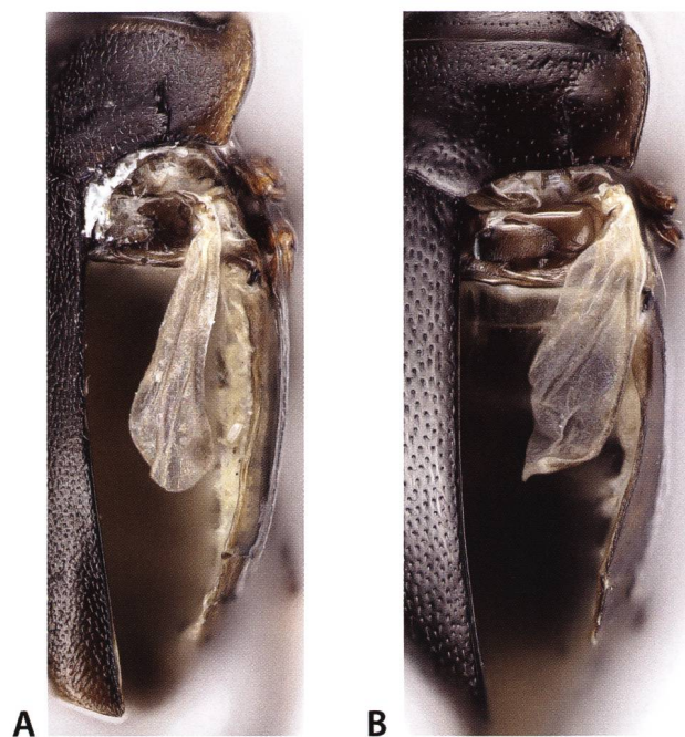
Figure 2. Liodessus spp., female paratypes: Metathoracic wing of paratypes of Liodessus caxamarca sp. nov. (A); Liodessus altoperuensis sp. nov. (B).

254 Paratypes (MUSM, ZSM). 100 exs.: same data as holotype; 30 exs.: Peru: Cajamarca, Cajamarca, Encañada District, Conga, 4013 m, 7.ix.2018, -6.95, -78.354, Y. S. Megna & N. Zenteno (PER_YSM_2018_45); 55 exs.: Peru: Cajamarca, San Pablo, Tumbaden District, Alto Peru, 3928 m, 8.ix.2018, -6.887, -78.595, Y. S. Megna & N. Zenteno (PER_YSM_2018_47); 23 exs.: Peru: Cajamarca, San Pablo, Tumbaden District, Alto Peru, 3947 m, 8.ix.2018, -6.892, -78.599, Y. S. Megna & N. Zenteno (PER_YSM_2018_48); 23 exs.: Peru: Cajamarca, San Pablo, Tumbaden District, Alto Peru, 3961 m, 8.ix.2018, -6.894, -78.6, Y. S. Megna & N. Zenteno (PER_YSM_2018_49); 41 exs.: Peru: Cajamarca, San Pablo, Tumbaden District, Alto Peru, 3933 m, 8.ix.2018, -6.902, -78.603, Y. S. Megna & N. Zenteno (PER_YSM_2018_50); 12 exs.: Peru: Cajamarca, San Pablo, Tumbaden District, Alto Peru, 3935 m, 8.ix.2018, -6.91, -78.614, Y. S. Megna & N. Zenteno (PER_YSM_2018_51).