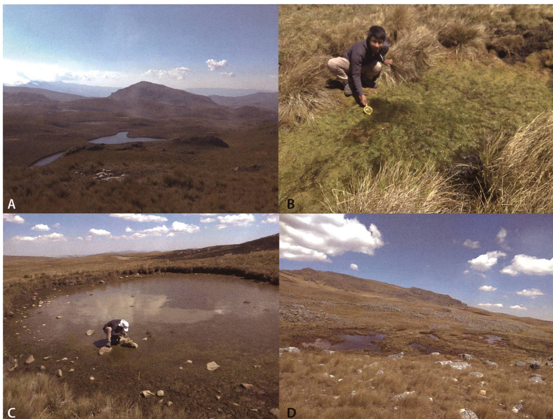
Figure 6. Habitats and landscapes at localities Cajamarca, Cajamarca, Encañada District, Conga, 4030 m [PER_YSM_2018_046] (A, B) and Cajamarca, San Pablo, Tumbaden District, Alto Peru, 3935 m [PER_YSM_2018_51] (C, D).