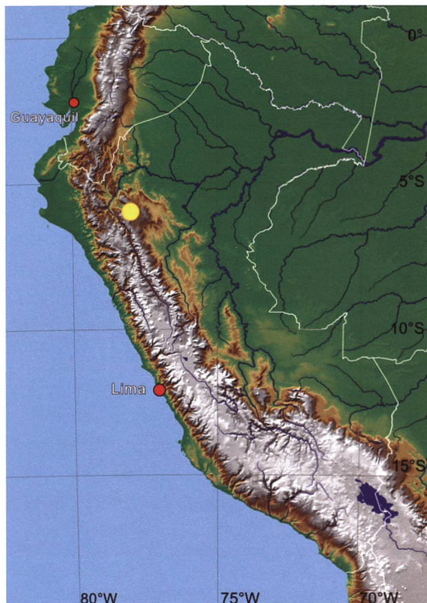
Figure 4. Distribution area (orange dot) of Liodessus caxamarca sp. nov. and Liodessus altoperuensis sp. nov. in the northern Andes of Peru.

Female. Dorsal surface dull due to presence of well impressed microreticulation between surface punctation (Figs 1A–C, 2A).