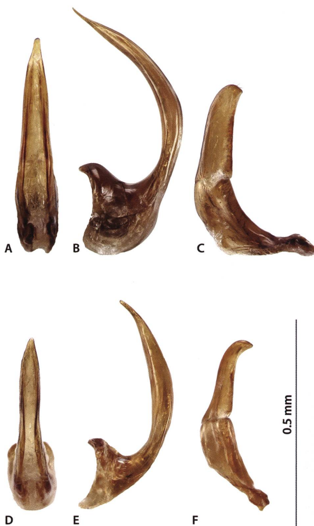
Figure 3. Liodessus spp. males: Liodessus caxamarca sp. nov., holotype, median lobe of aedeagus in ventral view (A), same in lateral view (B), right paramere external surface view (C); Liodessus altoperuensis sp. nov. holotype, median lobe of aedeagus in ventral view (D), same in lateral view (E), right paramere external surface view (F).

Structures. Antenna stout. Head with faint cervical line that dissolves into serial punctures laterally; with rounded clypeus. Pronotum with distinct lateral bead; with distinct and deep basal striae (as in Fig. 1D). Elytron without obvious basal striae on left side and very short