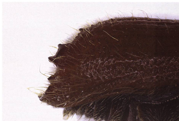
Figure 1. Lateral view of a male Ips duplicatus showing the characteristic spines 2 and 3 on its declivity (photo: G. Casciano, WSL).

The catches were morphologically and genetically identified to the species level. Morphological identification was done using the key of Pfeffer (1995). Comprehensive and well-illustrated compilations of the key characteristics for discriminating the closely related Ips species, i.e. I. typographus , I. amitinus , and I. duplicatus , can be found in Steyrer (2019) and Bussler (2020). The most typical feature is the ridge between spines 2 and 3 (Fig. 1). The sexes