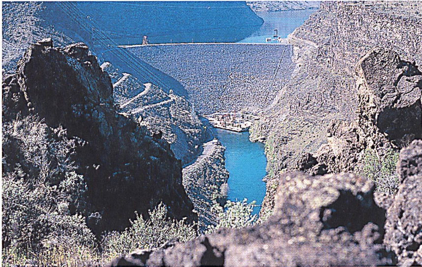
Round Butte Dam.