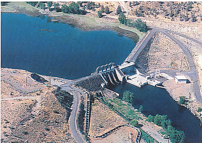
Regulating Dam with fish passage facilities.