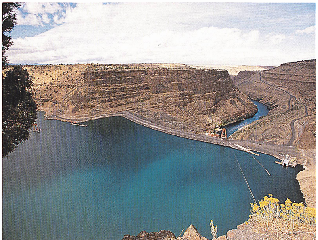
Lake Billy Chinook at Round Butte Dam.

«PGE and the Tribes share the stewardship of one of the West's most precious resources, the Deschutes River»,