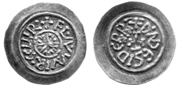
Fig. 3 (2:1).

Vercelli tremisiss published in the auction catalogue, probably struck by Desiderius in 773–774