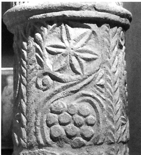
Fig. 5: A six-ray star pattern on a capital, Santa Giulia Museum, Brescia, Italy.

The six-ray star tremisses of Desiderius represent a traditional Lombardic pattern, as is also precisely documented by Pardi 15 , who demonstrates that the six-ray star is largely used as a decorative element in stuccos, plutei and fibula belts of the Lombardic period (see a detail of a column capital in fig. 5).