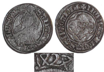
Figure 2: St. Gallen, Plappart, 1424, Arabic numerals, Leu Auction, 22 Oct, 2002, Levinson V-1a, illustrated coin from author's collection

In 1424, St. Gallen struck a silver coin with a denomination called a Plappart shown in Figure 2 . As noted in many sources, this is the first European coin struck with an Anno Domini date using PN 17 . The date uses the contemporary Arabic numerals. Re-enforcing the conclusion that Bruges was the source for the numerals, Zürich and Schaffhausen struck undated coins whose reverses were nearly identical to the 1424 Plappart of St. Gallen.