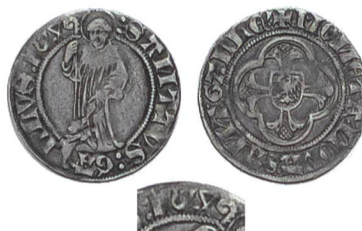
Figure 4: St. Gallen, Plappart, 1424, Gobar numerals, Sincona Auction, 23 May, 2012, Levinson V-1b

An example of a St. Gallen Plappart with clear lettering, Figure 4 , appeared on the market in 2012. Levinson had described the date area as a “disaster” 22 . In the area where a date would appear, there were unidentified symbols followed by the contemporary Arabic form of the numeral four.