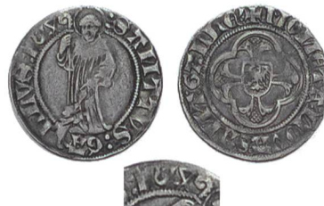
Figure 4: St. Gallen, Plappart, 1424, Gobar numerals, Sincona Auction, 23 May, 2012, Levinson V-1b

An example of a St. Gallen Plappart with clear lettering, Figure 4 , appeared on the market in 2012. Levinson had described the date area as a “disaster” 22 . In the area where a date would appear, there were unidentified symbols followed by the contemporary Arabic form of the numeral four.