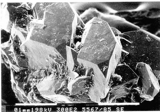
Fig. 3 SEM-picture of ideally shaped gasparite crystals.