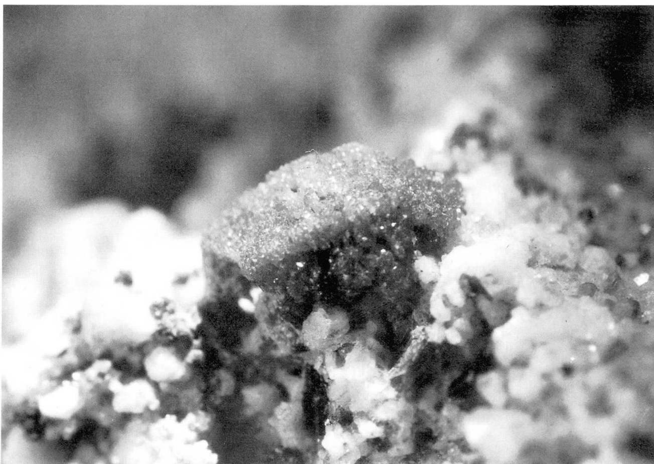
Fig. 1 Pseudomorph of gasparite after barrel-shaped synchisite (length 5-6 mm).

Pizzo Cervandone (in Italian) or Cherbadung (in local Swiss dialect) is a remarkable mountain peak between V. Devero in Italy and Binntal in Switzerland. The whole region belongs to the Penninic Mte.-Leone nappe, consisting partly of meta-sediments together with predominant gneisses which were influenced by lower amphibolite zone metamorphism: the mesocoic meta-sediments are partly kyanite-bearing. As the nappe has an almost horizontal position, the geological situation is more or less identical on both sides of the border. The formation of fissure minerals in the whole region has been strongly influenced by the remobilisation process of hercynic Cu-As-ores (tennantite, chalcopyrite) during Alpine metamorphism. These migrating arsenic bearing solutions resulted in the generation of a large number of highly special minerals, mainly arsenate and arsenite minerals (GRAESER, 1966; GRAESER and ROGGIANI,